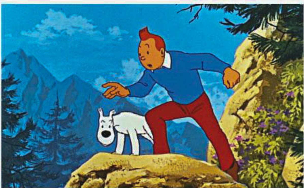
Tintin and the Lake of Sharks