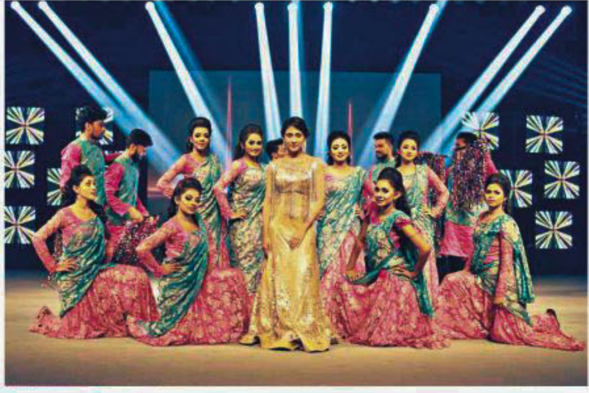
Shaat Ronger Chhonde