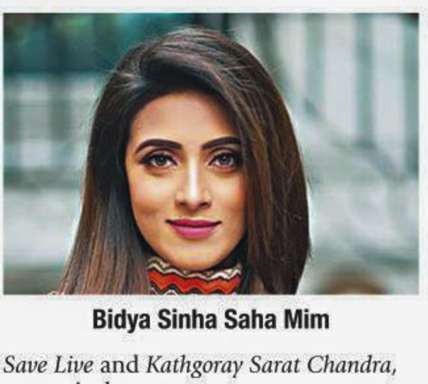
Bidya Sinha Saha Mim

Save Live and Kathoray Sarat Chandra , respectively. Dhallywood star Apu Biswas has acted in nearly 70 films opposite Shakib Khan in her career. She has reduced the number of projects she works on simultaneously these days. Presently, she is working on the movie Bhalobasha Zindabad . Bidya Sinha Saha Mim made her mark in showbiz at the very beginning of her career by winning the title of Lux Channel i Superstar. In the following years, Mim became one of the most sought after actors in the film industry and even went on to win a National Film Award for her work. Currently, Mim is awaiting the release of her film Shaap Ludu . She will soon begin filming for the upcoming movie Poran . Mim also takes time out to act in web series once in a while. Heartthrob Pori Moni rose to fame quite quickly upon commencing her career in Dhallywood. Her films have all been well received by the audience,