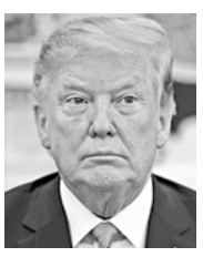
President Donald Trump said he has received a "very beautiful letter" on Thursday from North Korean leader Kim Jong Un and added that he could have another meeting with him.