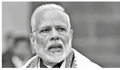
Prime Minister Narendra Modi told the people of Jammu and Kashmir on Thursday that elections would be held soon in the state for the local assembly...