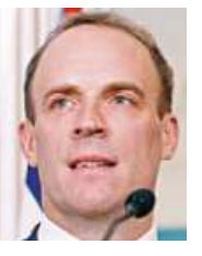
British Foreign Secretary Dominic Raab said the British government wanted to leave the European Union with a deal, but would do so without one if EU negotiators did not alter their stance...