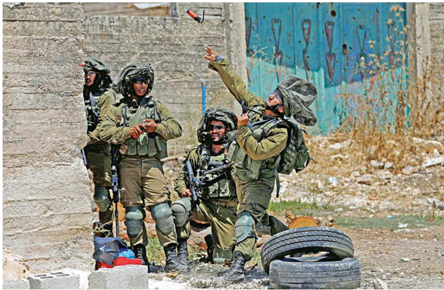
An Israeli soldier hurls a sound grenade towards Palestinian demonstrators during a protest against the nearby Jewish settlement of Qadomem, in the village of Kofr Qadom in the Israeli-occupied West Bank yesterday.