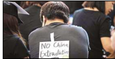
Protesters have continued to stage almost daily rallies despite increasingly violent confrontations with police that have prompted several countries to issue Hong Kong travel warnings for their citizens.

Hong Kong's leader Carrie Lam yesterday warned that two months of pro-democracy demonstrations were causing economic chaos in the city but ruled out making concessions to "silence the violent protesters..."