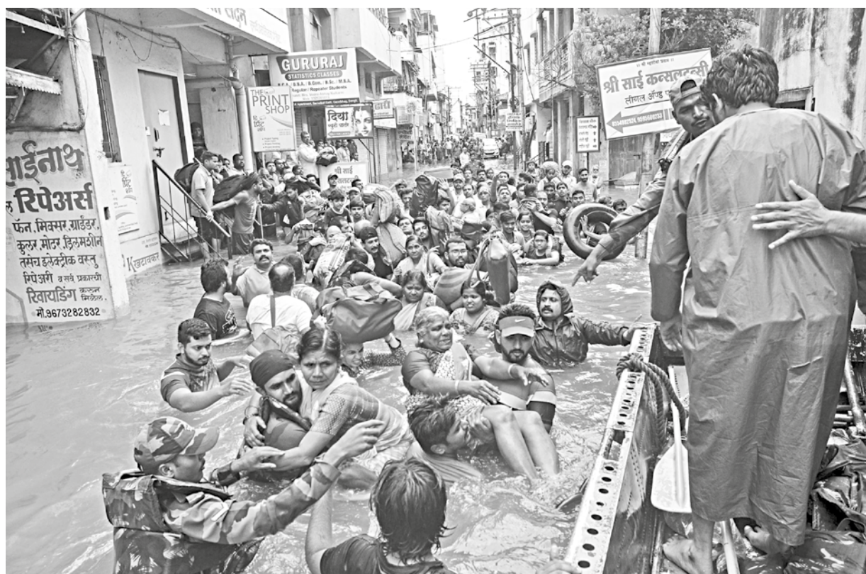
In this photograph taken on Thursday, Indian Army personnel rescue people stranded in flood waters after heavy rains on the outskirts of Sangli in Maharashtra state.