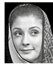
Maryam Nawaz was remanded to custody on corruption charges filed by a national anti-graft agency...