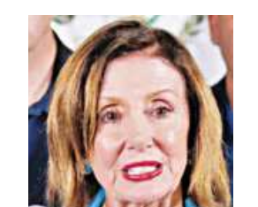
The Russian foreign ministry said in a statement yesterday that it considered the posting of a map showing the location of a Moscow rally a "call to participate..."