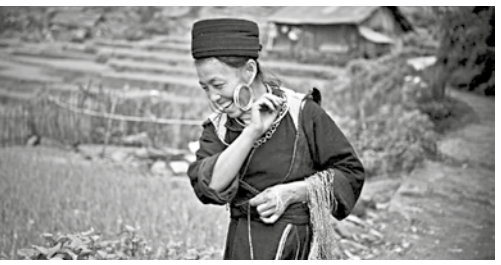
Indigenous peoples said on Thursday that a United Nations report on climate change had for the first time recognised their land rights as important for curbing global warming...