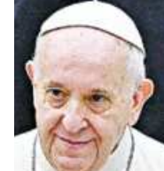
The pope warned in an interview published yesterday in newspaper La Stampa that "sovereignism reveals an attitude toward isolation..."