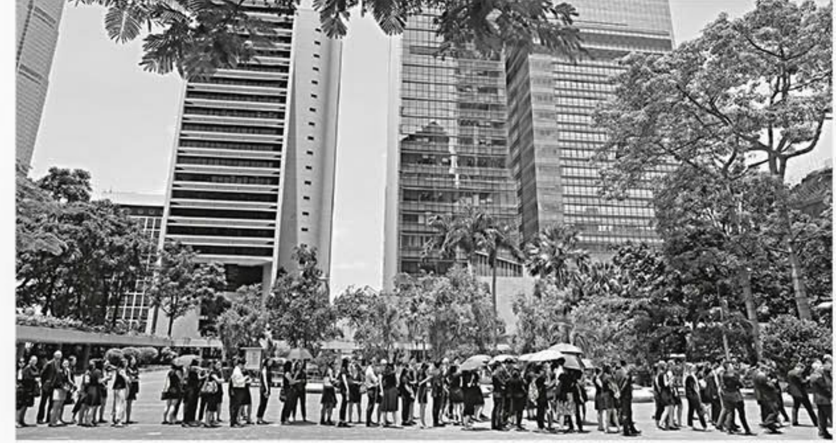
Lawyers and workers in Hong Kong's legal sector walk during a silent protest march to the Department of Justice in Hong Kong, China.