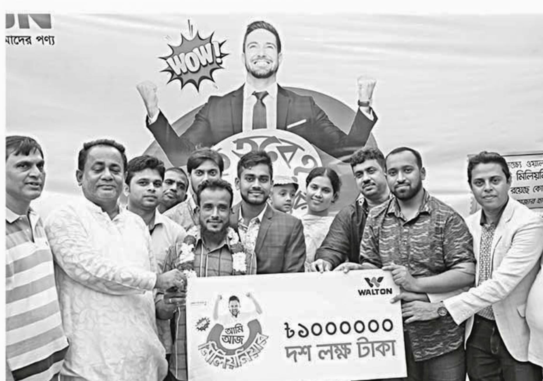
Mehidy Hasan Miraz, national cricketer and brand ambassador of Walton, hands over a cheque worth Tk 10 lakh to a customer, who had bought a refrigerator and gone on to become a winner of the company's ongoing digital campaign centring Eid-ul-Azha, in Khulna on Wednesday.