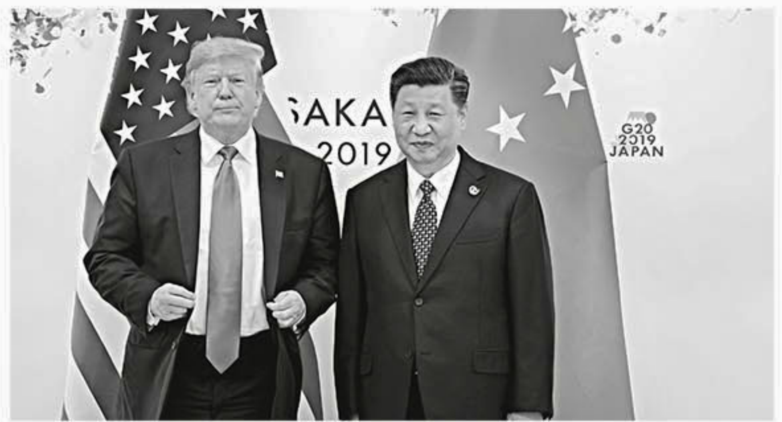
US President Donald Trump and China's President Xi Jinping pose for a photo ahead of their bilateral meeting during the G20 leaders summit in Osaka, Japan.