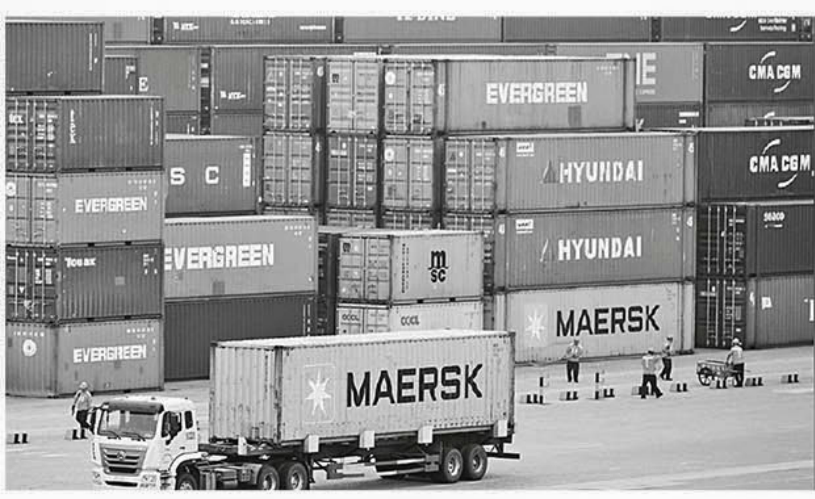
A truck transports a container at a port in Qingdao, Shandong province, China.