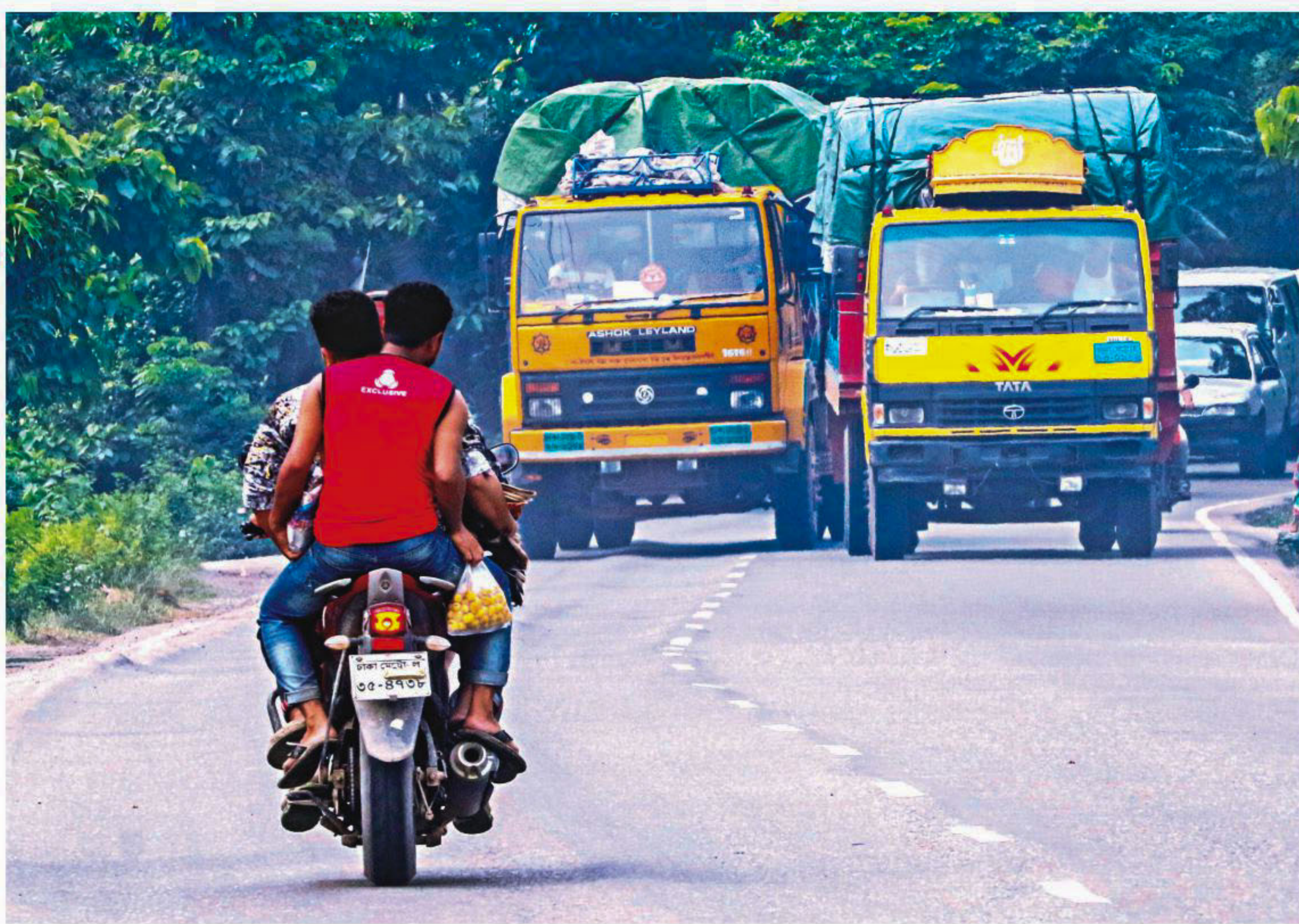
A truck loaded with goods tries to overtake another near a turn on Dhaka-Sylhet highway in Narayanganj's Rugganj area recently. Overtaking at such places is prohibited as it carries risks of accidents.