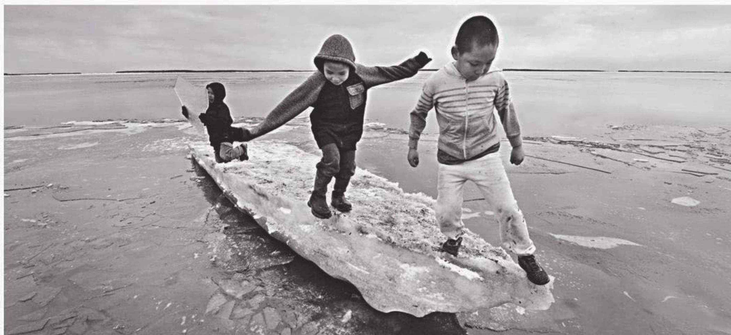
Schoolchildren play on melting ice in the climate change-affected Yupik Inuit village of Napakiak on the Yukon Delta in Alaska.

Today, we are seemingly transitioning to a new geologic epoch, Holocene to Anthropocene, where the climate is very different from the one our ancestors knew. Confronting realities of the new epoch requires courage which many of our leaders lack. Also, their myopic vision does not allow them to think beyond the next election. In fact, a group called