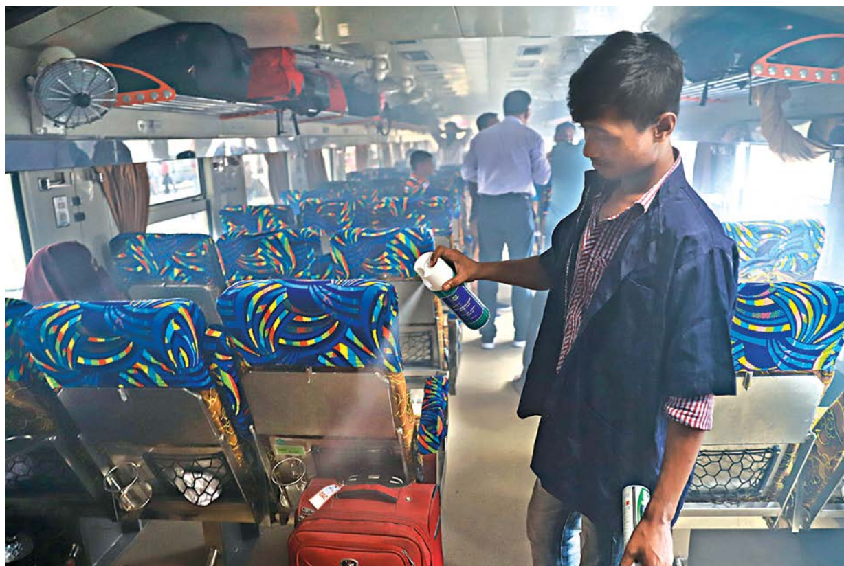
Railway employees spray anti-mosquito aerosol in a train carriage at Kamalapur Railway Station yesterday before the train is to depart. The authorities decided spray every carriage recently to reduce the chances of dengue infection.