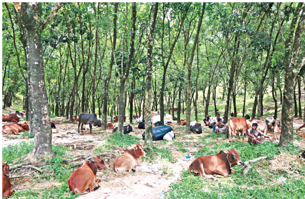
Traders have turned a rubber plantation on Lakkatura Tea Estate near Sylhet city into a makeshift cattle market. The photo was taken on Tuesday.

BFUJ is set to demonstrate in front of Jatiya Press Club at 11am today, along with its associate bodies doing the same at local press clubs across the country, a statement said.