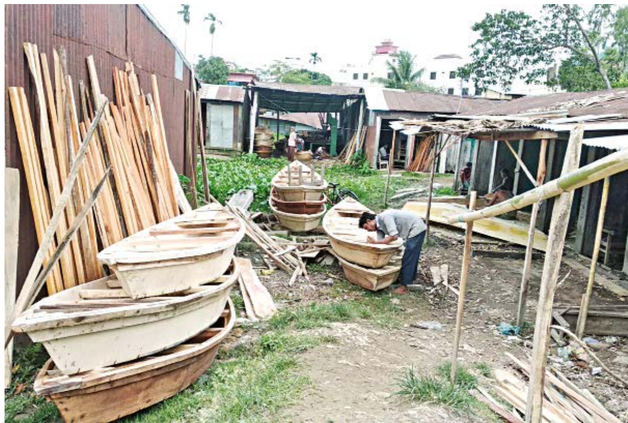
Demand for boats peaks during monsoon in haors of Sylhet division. In a recent photo, a boat maker is seen at work in Khowaimukh area of Habiganj town.