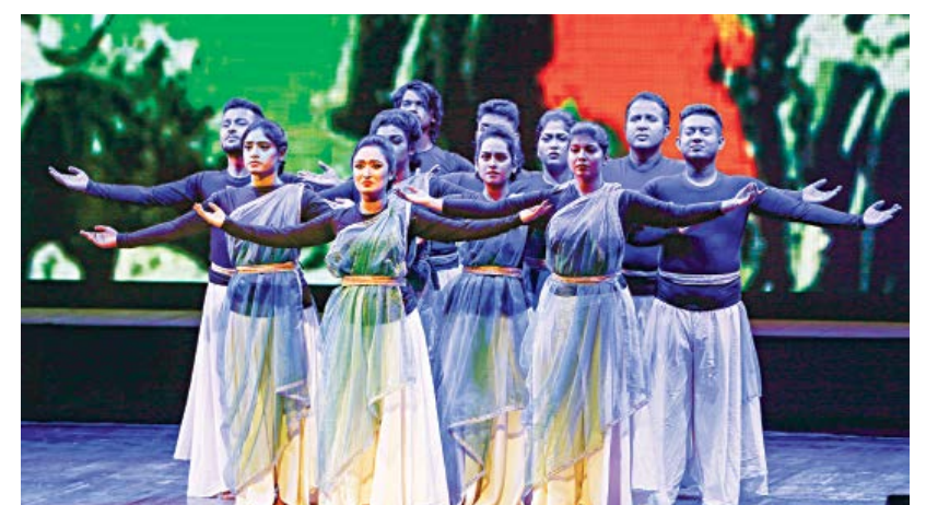
Marking the 44th death anniversary of Bangabandhu Sheikh Mujibur Rahman, Bangladesh Shilpakala Academy is hosting a month-long tribute to the Father of the Nation. Bangladesh Shilpakala Academy Shishu Dol performed on the song 'Dhonno Mujib Dhonno' whereas the Bangladesh Shilpakala Academy Nritya Dol performed on 'Dukhini Bangla, Jononi Bangla' on August 6, 2019, in a cultural event, before the staging of the play 'Mujib Mane Mukti'.