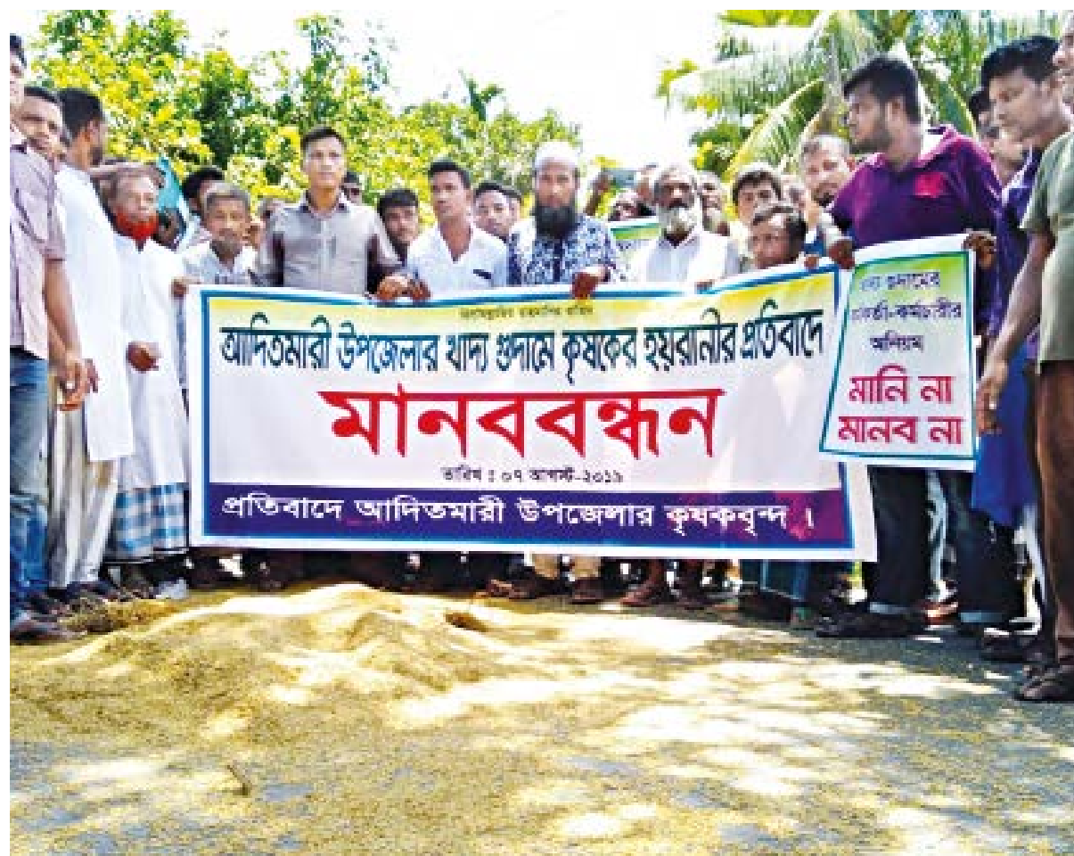
Several hundred farmers from Lalmonirhat's Aditmari upazila yesterday blocked Lalmonirhat-Burimari Highway in front local storage depot (LSD). Forming a human chain there, they alleged that the food inspector at the LSD has been extorting money from them while buying paddy for the government.