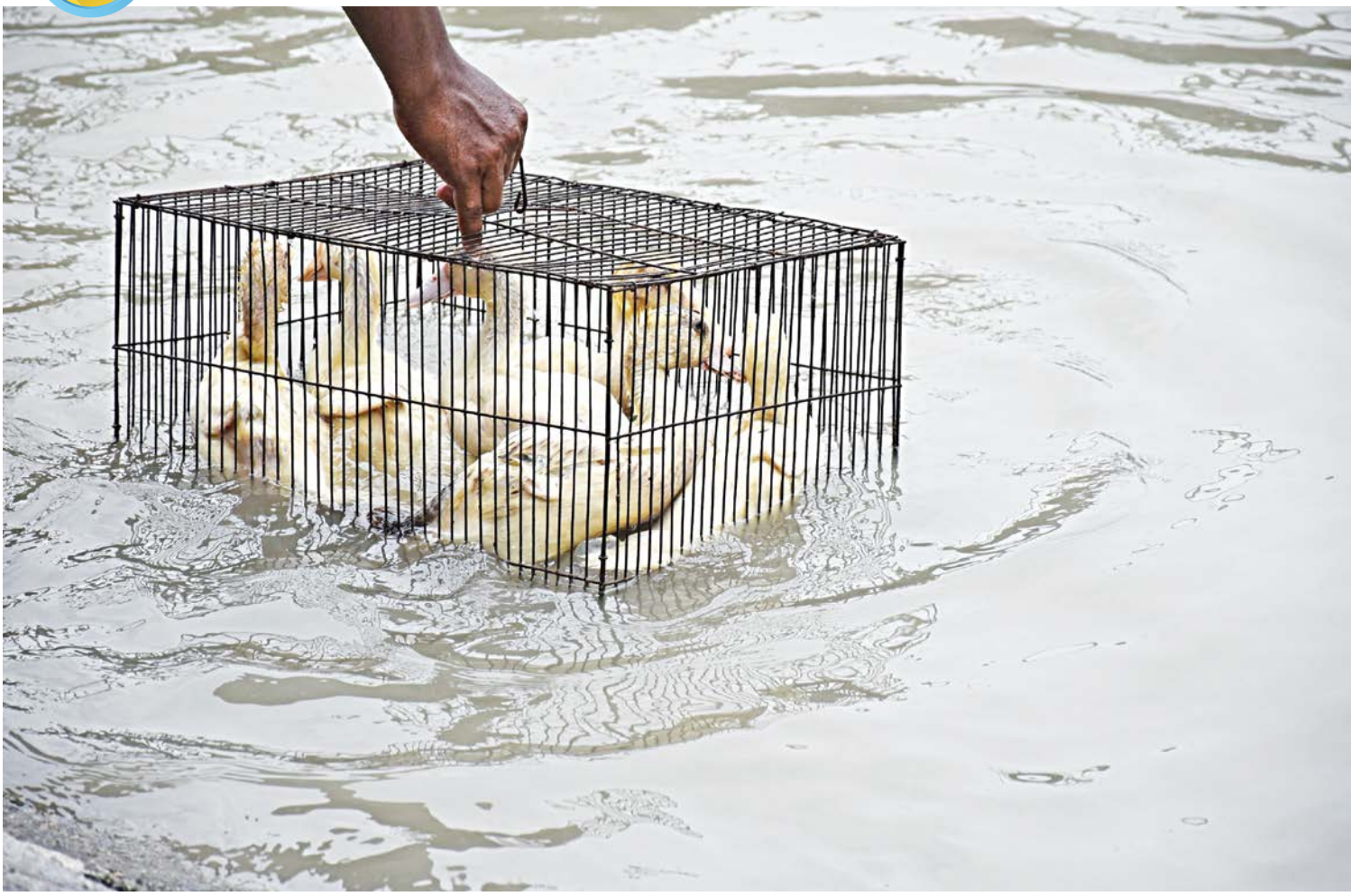
Caged ducks get to take a dip in the Kirtonkhola river for some relief from the heat. The photo was taken recently from Barishal's DC Ghat area.