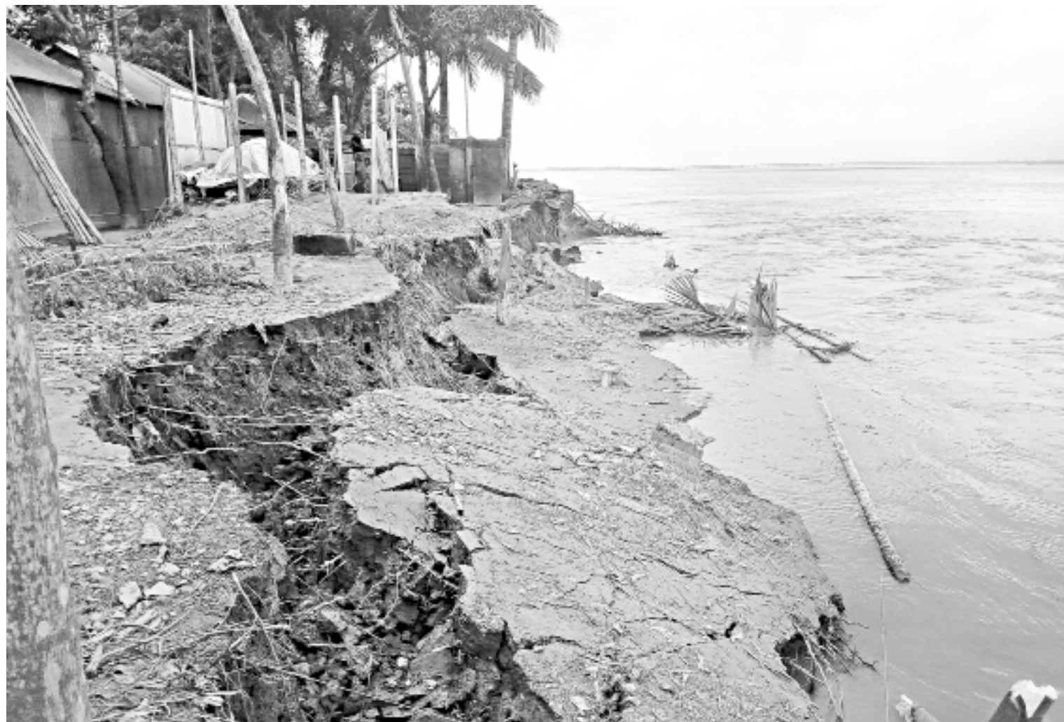
With water level falling in the Jamuna, erosion by the mighty river has taken a serious turn in Govindasi union of Tangail's Bhuapur upazila. The photo was taken from Bhalkutia village yesterday.