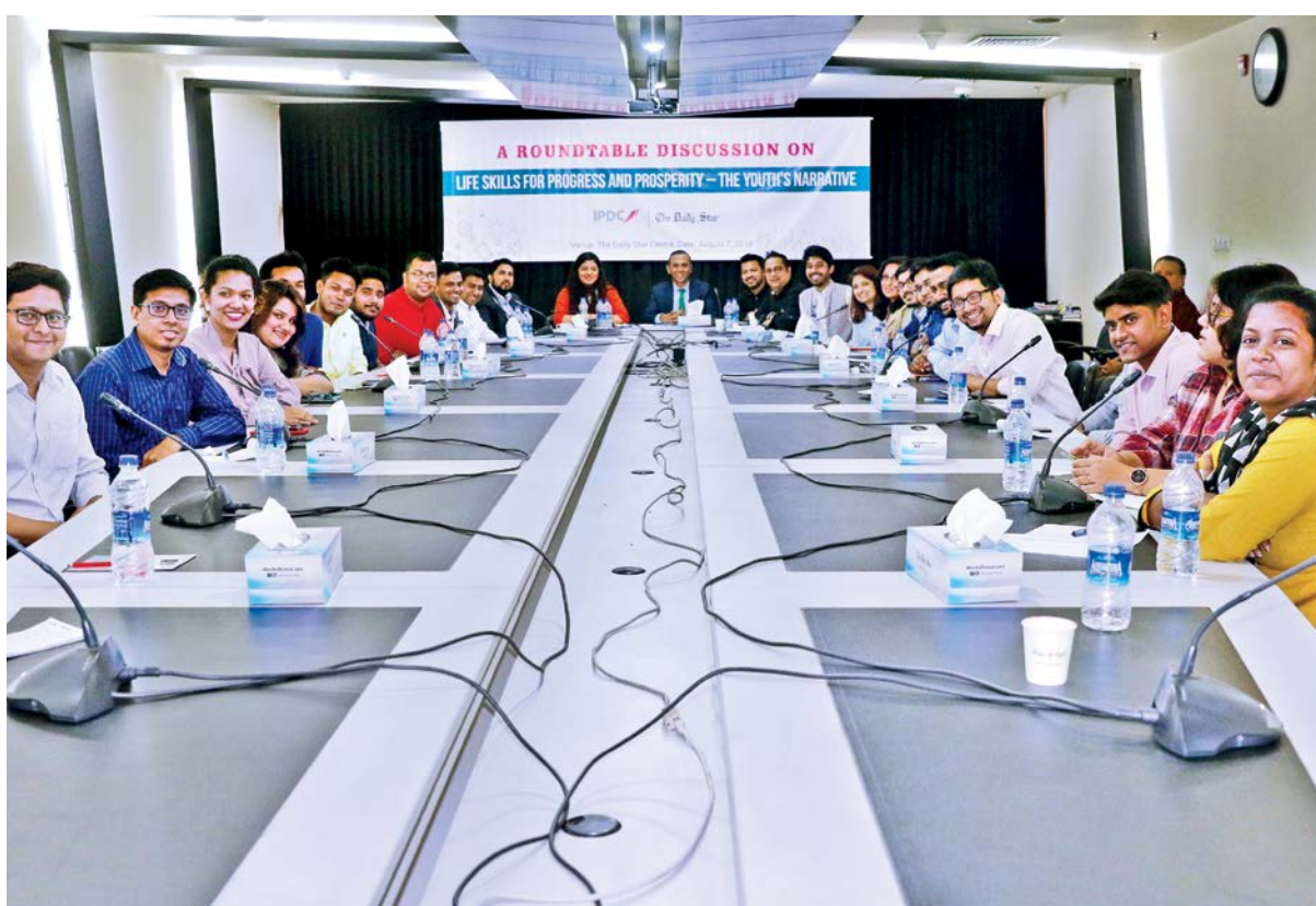
Discussants at the roundtable yesterday at The Daily Star Centre.

Bangamata, Bangabandhu 0 Bangladesh Organiser: Bangabandhu Gobeshana Parishad Venue: Jatiya Press Club Time: 10:30am