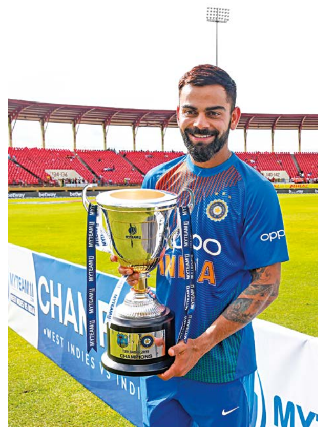
India captain Virat Kohli holds the series trophy after beating West Indies in the third T20I at the Guyana National Stadium in Providence on Tuesday.

"He's got a lot of skill and talent," Kohli said. "It's about winning and finishing games like these and gaining