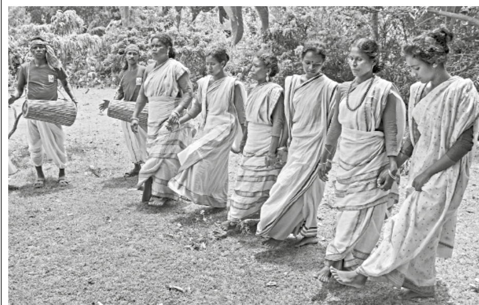
Indigenous Santal women from Gobindaganj upazila of Gaibandha participate in a traditional dance performance yesterday, marking International Day of the World's Indigenous Peoples, to be observed on tomorrow (August 9). Local indigenous communities during a day-long event also participated in a cultural programme, traditional archery show, discussion and rally on this occasion at Changuara Kacher Chura High School ground in Kamdia of the upazila.