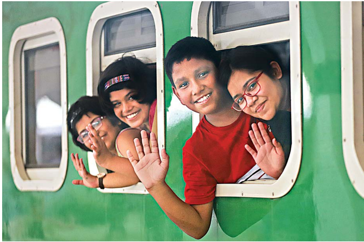
Children leaving the capital on their Eid holidays stick their heads out of train carriage windows and wave. The photo of the train heading for Rajshahi was taken yesterday at Kamalapur Railway Station.