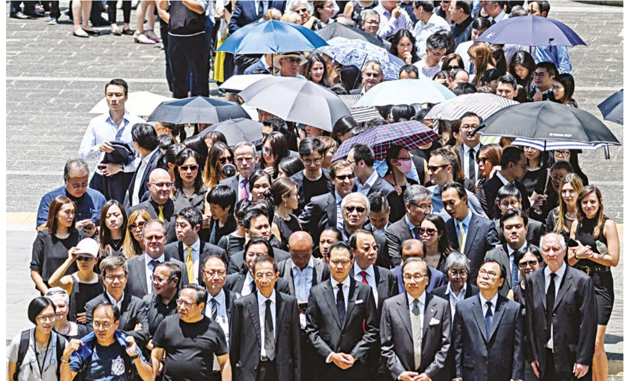
Lawyers and members of the election committee's legal sector hold a silent march against what they claim is political persecution by the Secretary for Justice, while demanding an independent inquiry into the anti-extradition law crisis, in Hong Kong yesterday.

The visits "will be about honoring victims, comforting communities, and thanking first responders & medical professionals for their heroic actions," White House Press Secretary Stephanie Grisham tweeted.