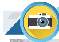
PHOTO OF THE DAY