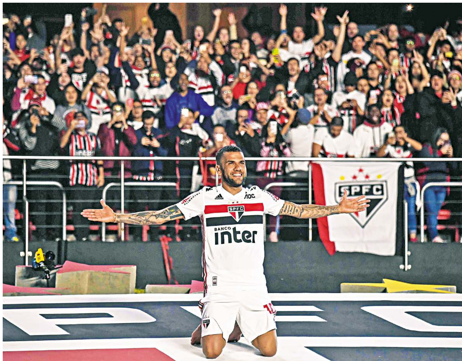
Wearing the jersey of his new club Sao Paulo, Brazil national team captain Dani Alves poses for photographers during his official presentation at the Morumbi Stadium on Tuesday.