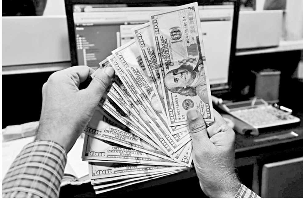
Is taka depreciation good for economy or bad?

But our exports are invoiced in US dollar, not in taka. So, a depreciation of taka does not lead to an automatic reduction in the prices of goods that Bangladesh exports. To see this, consider again the example used above. A Bangladeshi-made shirt is priced at USD 11.76 in the international market and the current exchange rate is USD 1 =