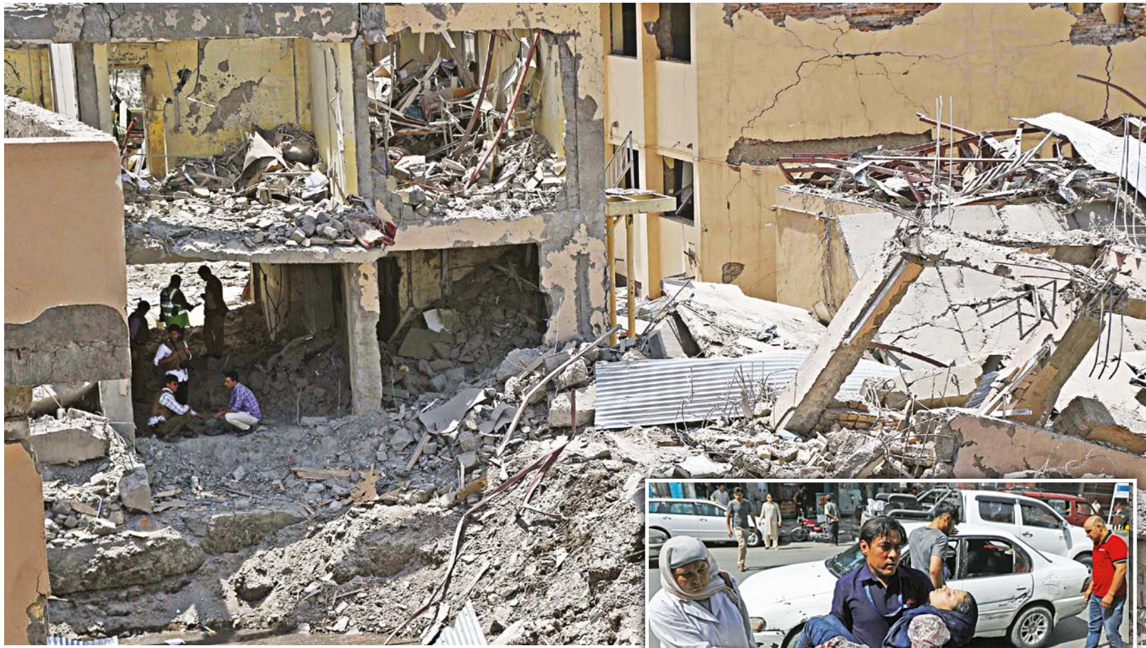
Afghan security forces investigate the site where a Taliban car bomb detonated at the entrance of a police station in Kabul yesterday. Inset, a man carries an injured woman to a hospital after the blast. At least 14 people were killed and 145 wounded in the blast, sending a massive plume of smoke over the Afghan capital and shattering windows far from the blast site.

Danish police said yesterday foul play was involved in a powerful explosion that rocked the national tax agency in Copenhagen, causing severe damage to the building's exterior but no serious injuries. The cause of the blast, which occurred Tuesday around 10:00 pm at the agency's headquarters in Osterbro, was not immediately known. Investigators were treating the incident as a criminal act.