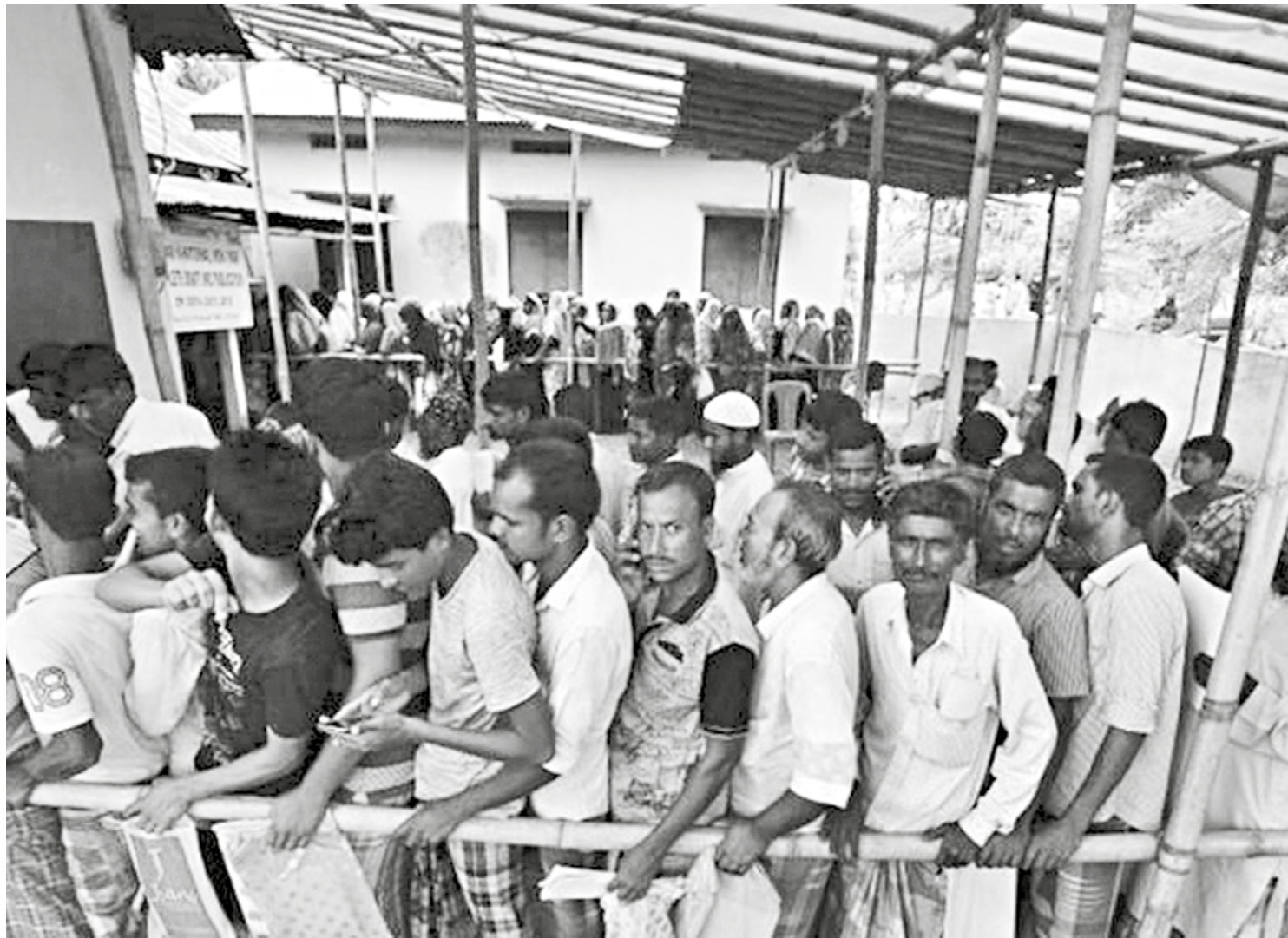
People wait in queue to check their names on the draft list at a National Register of Citizens (NRC) centre in Nagaon district, Assam, India.

However, all these informal exchanges, interviews and media analyses took place in the pre-election context of India. Although this had never been spelt out, for many Bangladeshis, this process of delisting citizens prior to the Lok Sabha election was initially thought to be just a political rhetoric or a stance of BJP to influence the electoral landscape in Assam. However, the way the illegal migration issue had been emphasised in the pre-election campaigns and the pace with which the NRC process was being conducted after the election, did raise an alarm that the promise to delist the alleged "illegal migrants" was perhaps never only a