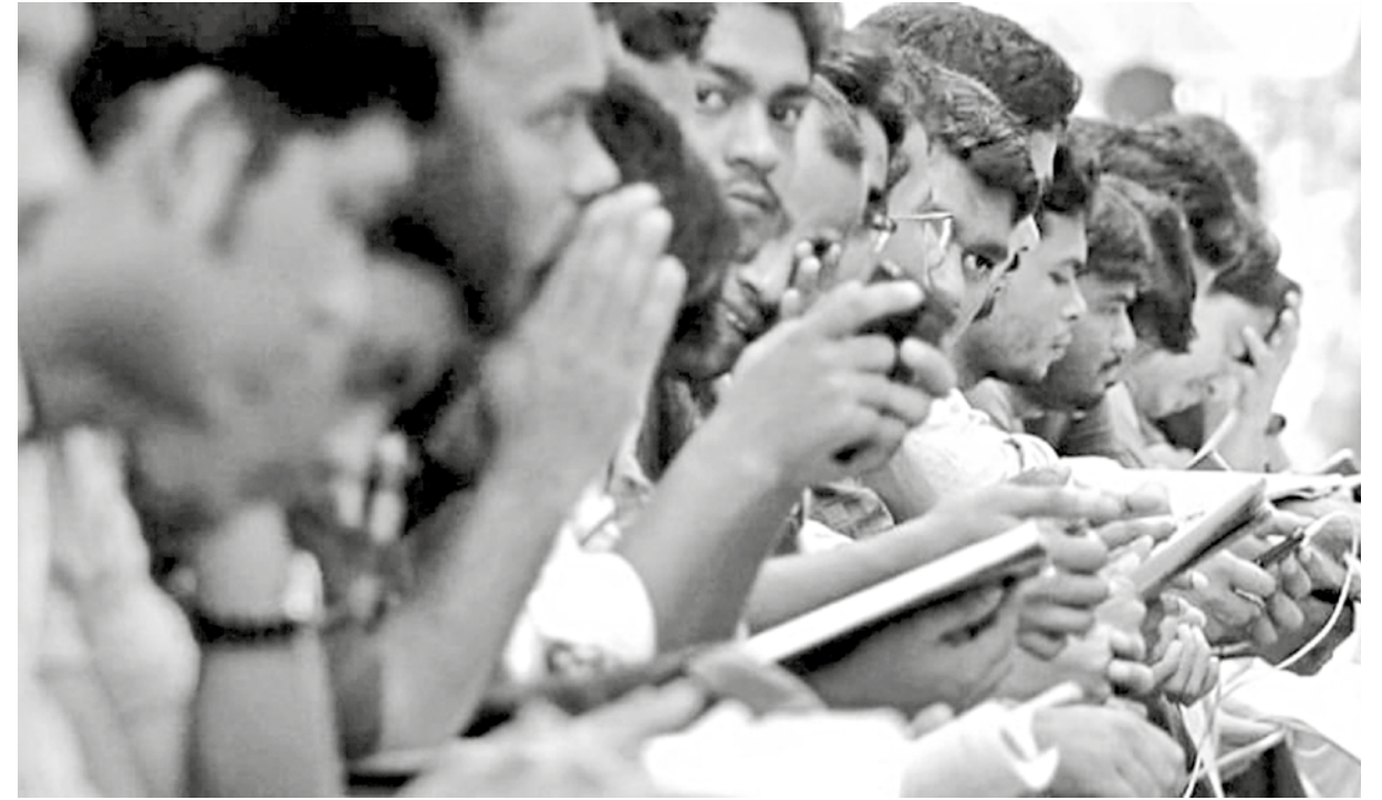
Youth unemployment remains a big problem for Bangladesh's economy.

The challenge of creating more jobs, therefore, is not restricted to only GDP or any other isolated issue or statistic. It wouldn't be an exaggeration to say that it is much more than that, as we can see from numerous examples around us—Syria: where US diplomatic cables show how US officials were working to stir up the young unemployed Syrian population against their government; Greece: where around 50 percent of the youth are unemployed, and its parliament and other government buildings are regularly surrounded by angry mobs setting whatever they can find on fire; France: where the Gilet Jaunes (Yellow-Vests) have been swarming the streets