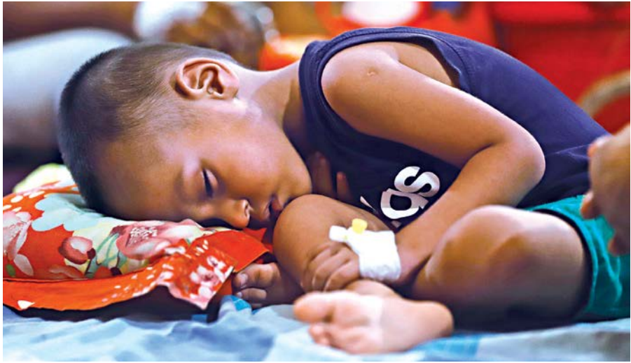
A pillow is placed under the head of this child with dengue after he fell asleep while sitting on his Mughda Medical College Hospital bed yesterday.

In Dhaka south, areas such as Meradia, Goran, Sayedabad, Muradpur and Hazaribagh have seen fewer patients admitted to hospitals than Lalmatia, Segunbagicha, SEE PAGE 2 COL 2