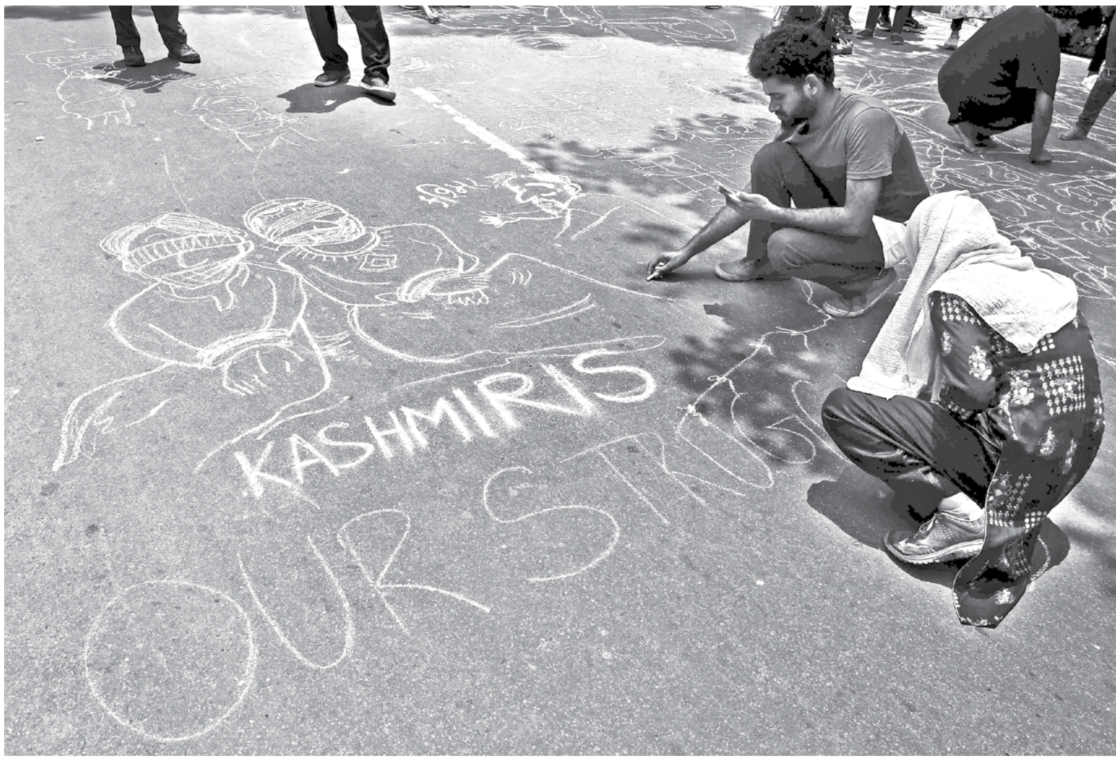
Communist Party of India (CPI) activists draw graffiti on the ground during a protest in New Delhi yesterday, in reaction to the Indian government scrapping Article 370 that granted a special status to Jammu and Kashmir.

Poland's Prime Minister Mateusz Morawiecki was condemned by Jewish groups in May when he said that holding Poland liable for the restitution would hand a "posthumous victory" to Adolf Hitler.