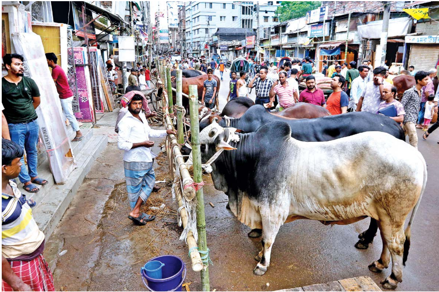
Instead of staying inside Samsabad field in Nayabazar, leased out by Dhaka South City Corporation for a makeshift market for sacrificial animals, traders are showcasing cattle for sale on adjoining roads, violating a government ban. The photo was taken yesterday.