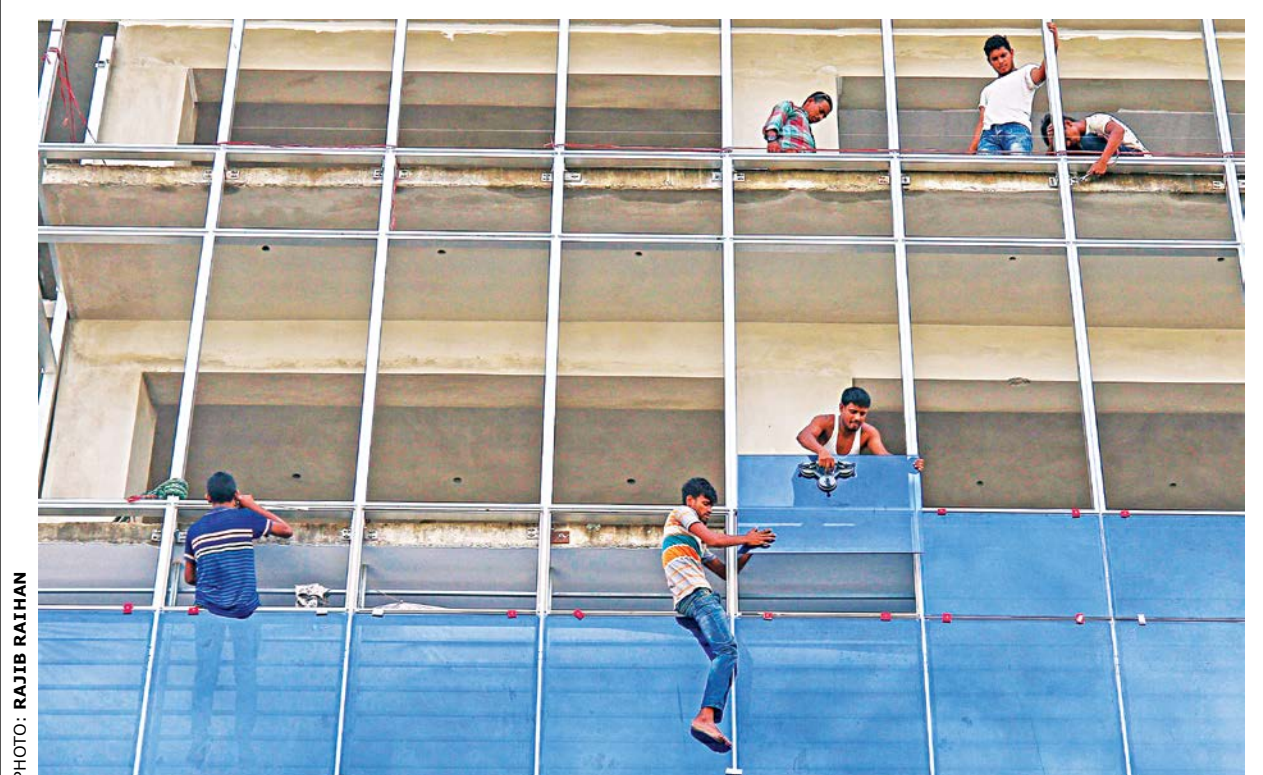
Workers install glass panels on a high-rise in Chattogram while sitting and leaning precariously on the frames without any form of harness. The photo was taken yesterday at Wasa intersection in Dampara.