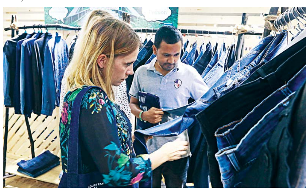
Garment products now account for 84 percent of total exports.

With exports not diversifying at the expected pace, the contribution of garment items in national exports claimed a larger share last fiscal year.