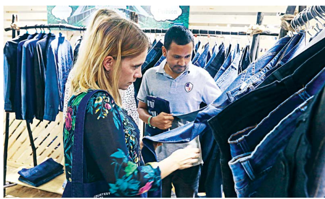
Garment products now account for 84 percent of total exports.

With exports not diversifying at the expected pace, the contribution of garment items in national exports claimed a larger share last fiscal year.