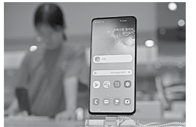
A visitor looks at a Samsung Galaxy S10 smartphone at its showroom in Seoul on August 2.

Japan holds a 60-70 percent share of the global hydrogen fluoride market, according to Taipei-based market