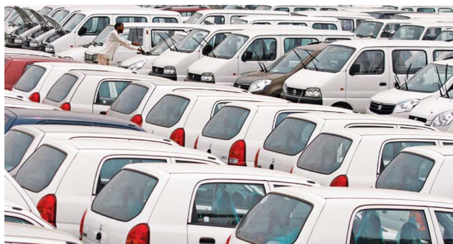
A worker adjusts the windscreen wipers of a parked car at a Maruti Suzuki stockyard on the outskirts of the western Indian city of Ahmedabad.

"China is now blackmailing India into using #Huawei for its 5G infrastructure - they know no bounds! The #CCP moves to strong-arming countries into exposing themselves to surveillance and espionage."