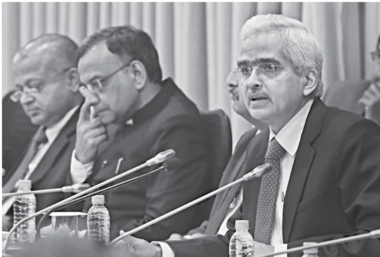
Reserve Bank of India governor Shaktikanta Das (R) speaks during a press conference at RBI headquarters in Mumbai yesterday.

"Domestic economic activity continues to be weak, with the global slowdown and escalating trade tensions posing downside risks," it added in a statement.