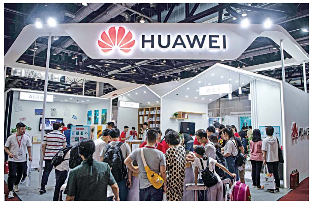
Attendees visit a Huawei exhibition stand during the Consumer Electronics Expo in Beijing on August 2.

"Huawei has carried out operations in India for a long time, and has made contributions to the development of Indian society and the