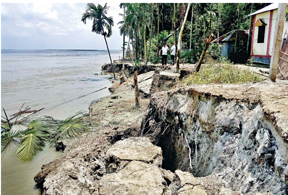
The Jamuna devours a part of Bhalkutia village in Tangail's Bhuapur upazila. Locals said around 300 houses of three villages went into the river early last month, but the authorities were yet to take any measures to save the rest of the villages. The photo was taken on Sunday.