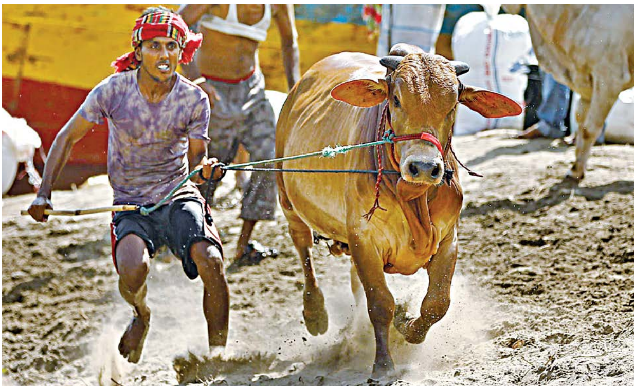
A man tries to tame a bull as it runs towards a temporary cattle market near the city's Postogola Shashan Ghat yesterday after being offloaded from a boat. With the Eid-ul-Azha only four days away, a lot of traders from across the country have been brining sacrificial animals to the capital hoping to make good profits.