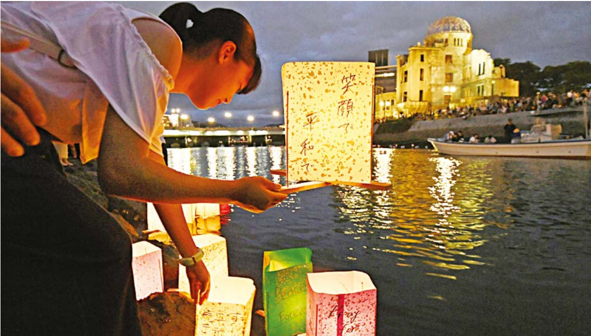
A girl releases paper lanterns yesterday on the Motoyasu River facing the gutted Atomic Bomb Dome in remembrance of atomic bomb victims on the 74th anniversary of the bombing of Hiroshima, Japan, in this photo taken by Kyodo.

However Rouhani described as “weird” the US approach of calling for negotiations and then slapping sanctions on Zarif.