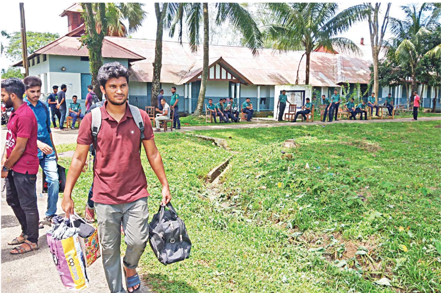
A student leaves MC College campus under police supervision yesterday. Resident students of the college informed that some students of Sylhet Government College stormed MC College Hall on Monday night. In order to avoid further untoward incidents, the principal declared Eid holiday and informed Shahporan Police Station.