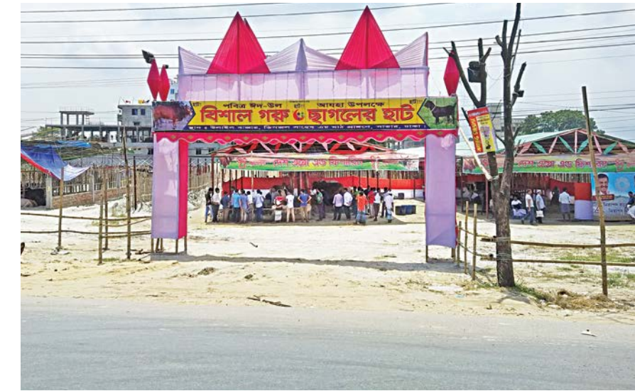
A colourful archway invites buyers into the cattle market.