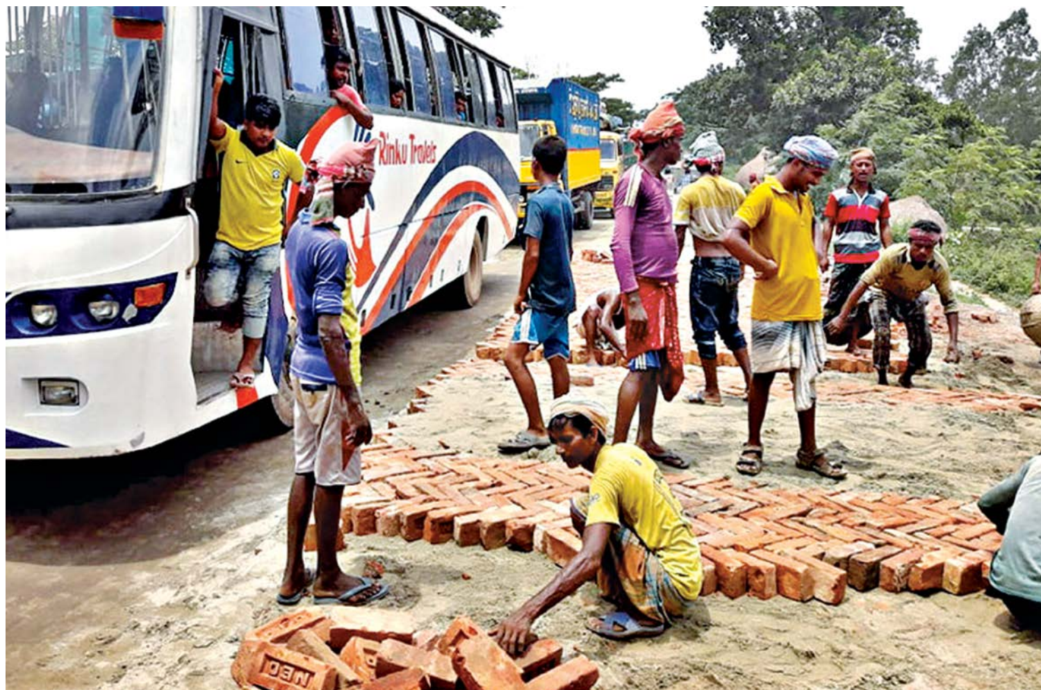
Workers repair the battered Hatikumul-Bonpara highway in Sirajganj's Tarash upazila yesterday. Locals said parts of the highway to Rajshahi were badly damaged last month due to waterlogging and flood. The repair work was already causing long tailbacks. Eid holidaymakers fear they would suffer delays on their journeys.