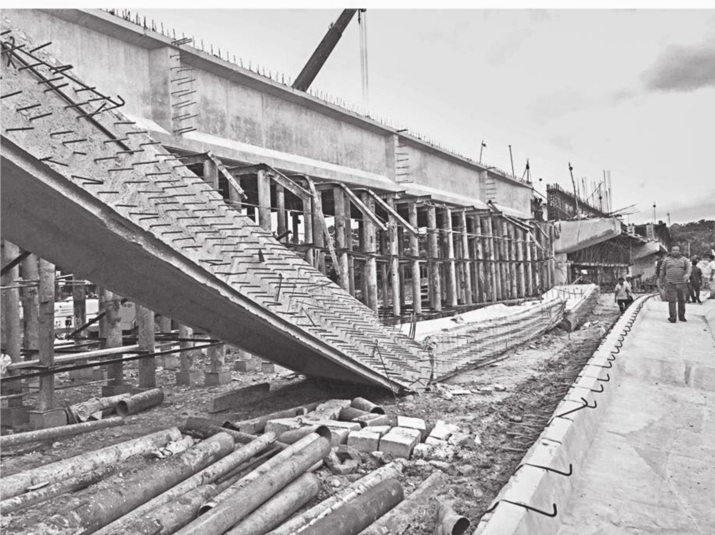
A couple of 100-foot-long girders of an under-construction bridge in Dhophagata area of Jhenidah Municipality tumbled down on Sunday. The Tk 120-crore bridge is being constructed by Japan International Cooperation Agency (Jica). Fortunately, there has been no casualties as all 20 workers at the site were at lunch when the incident took place.