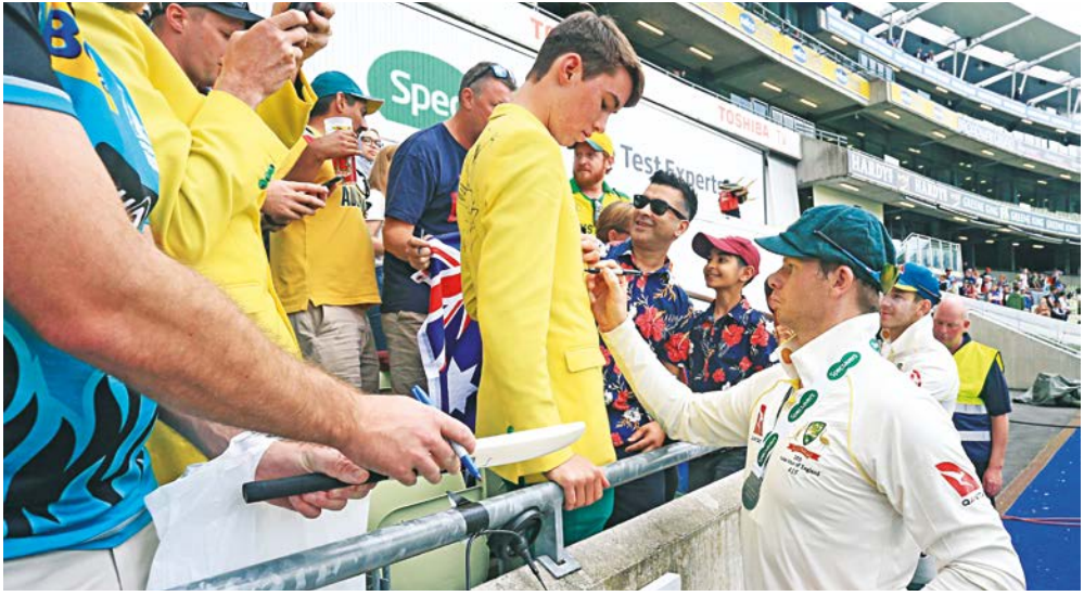
Australia batsman Steven Smith signs a young fan's shirt following the side's 251-run win in the first Ashes Test at Edgbaston in Birmingham yesterday.