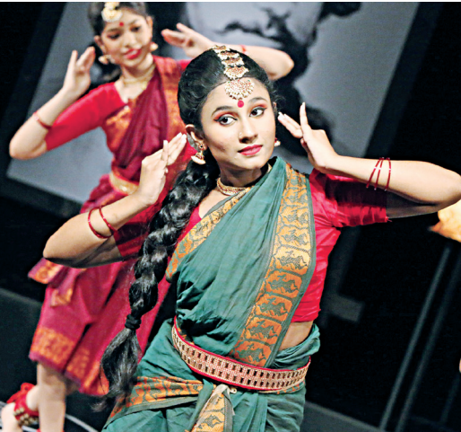
Momo Chitte Nite Nittey