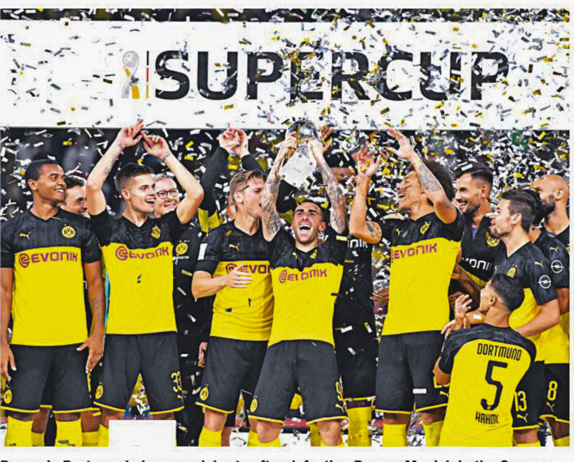
Borussia Dortmund players celebrate after defeating Bayern Munich in the German Super Cup on Saturday night, denying the Bavarians a fourth straight title.

It was also learnt that the BOA will likely vacate the dormitory in the Sultana Kamal Women's Sports Complex in Dhanmondi today, where eight female athletes were diagnosed with dengue fever. However, the BOA had already taken massive initiatives to avoid this particular situation by spraying mosquito insecticides through an Army unit while the complex was also cleaned regularly at the BOA's expenditure.