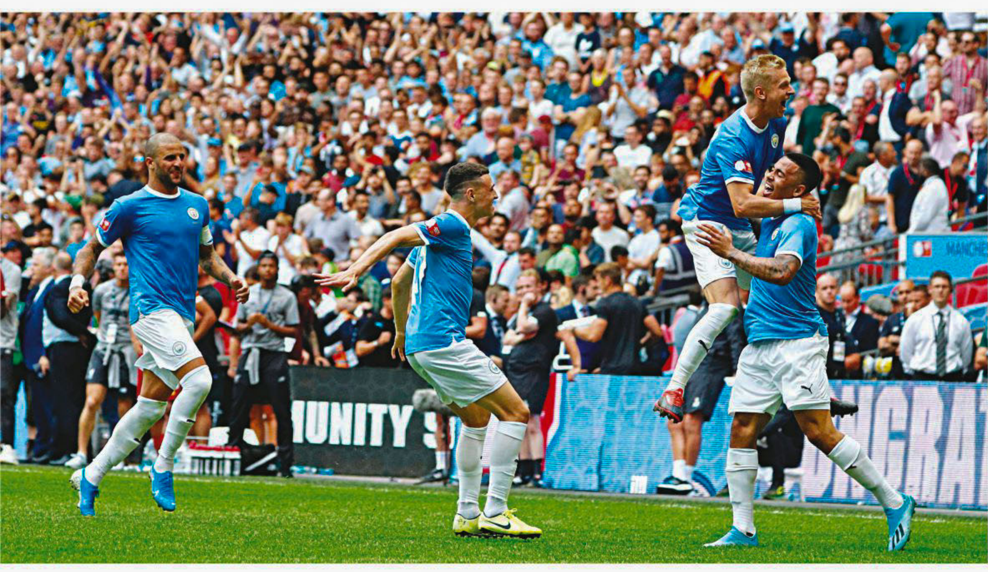
Manchester City players burst into celebration after Brazilian striker Gabriel Jesus (R) netted the match-winning penalty in their Community Shield game against Liverpool. Regulation time had failed to separate the the Premier League's pacesetters and ended 1-1.

The only dark cloud for City was an injury to Bayern Munich target Leroy Sane, who limped off in the 10th minute holding his right leg.