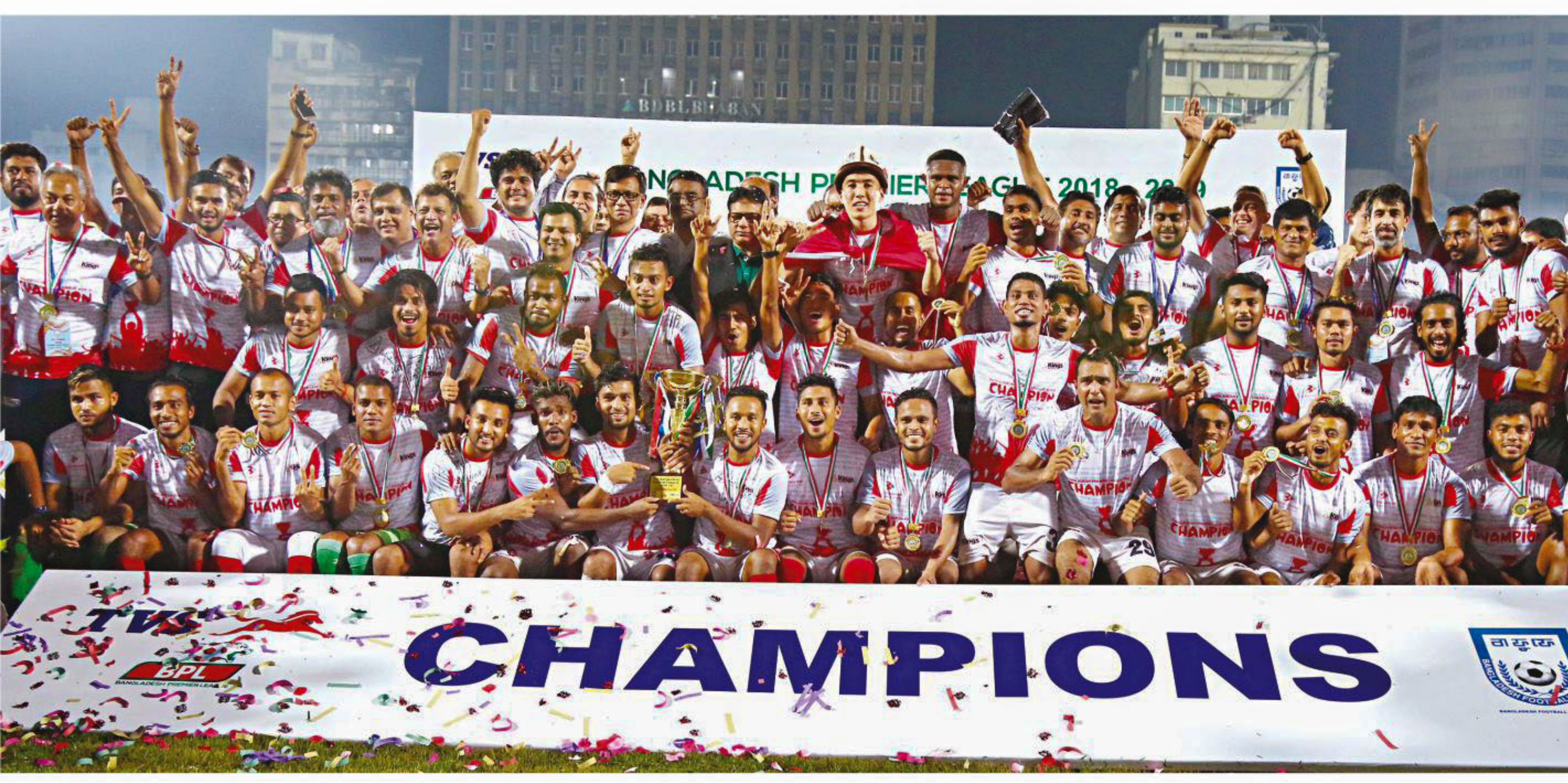
Bashundhara Kings' players celebrate with the Bangladesh Premier League trophy following a 1-1 draw against Chittagong Abahani at the Bangabandhu National Stadium yesterday.