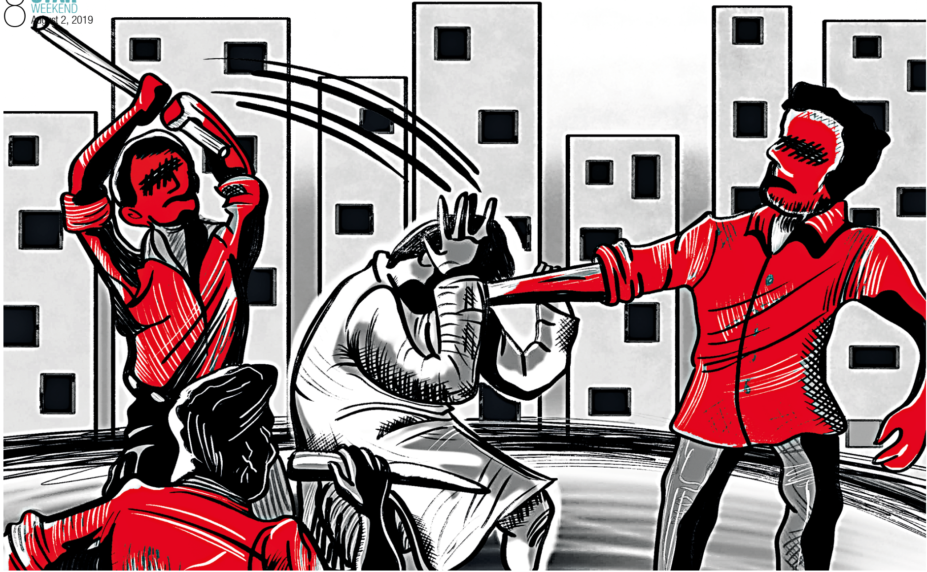
ILLUSTRATION: SHARARA ZAHEEN