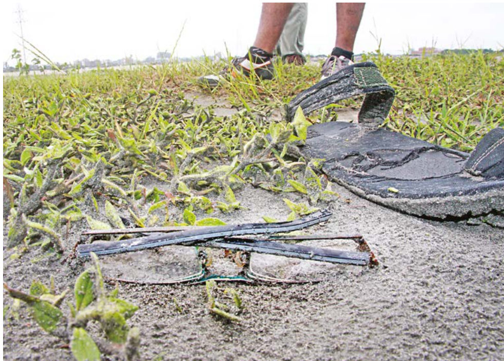
Sandal and glasses of one of the six students killed in mob beating in Amin Bazar.