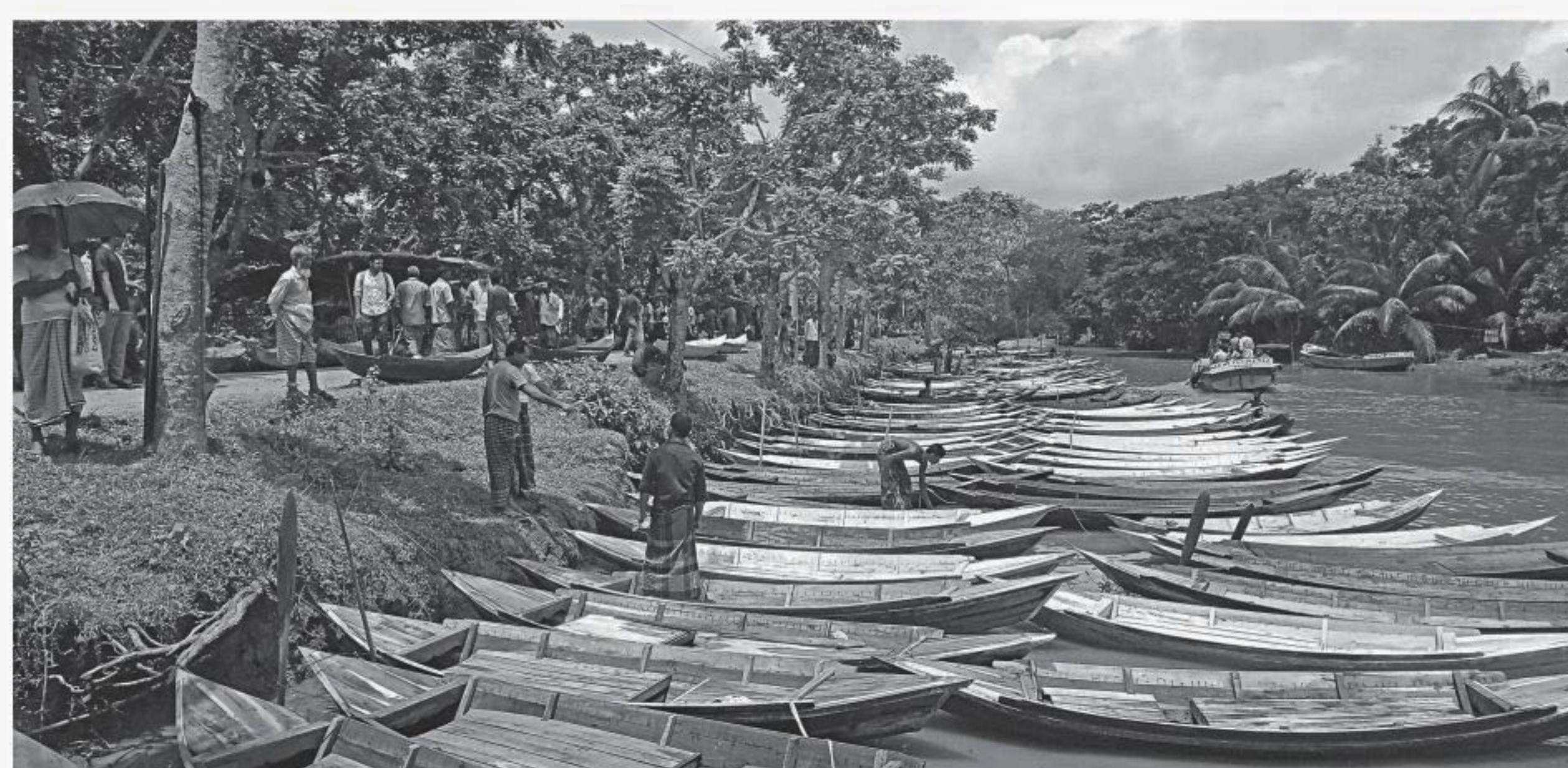
Boat builders, sellers and buyers gather at the weekly Atgar floating market of Pirojpur's Nesarabad. People use these for traveling in the area during the rainy season, during floods and for collecting and selling guava. The area is famous for its floating guava market. The photo was taken recently.