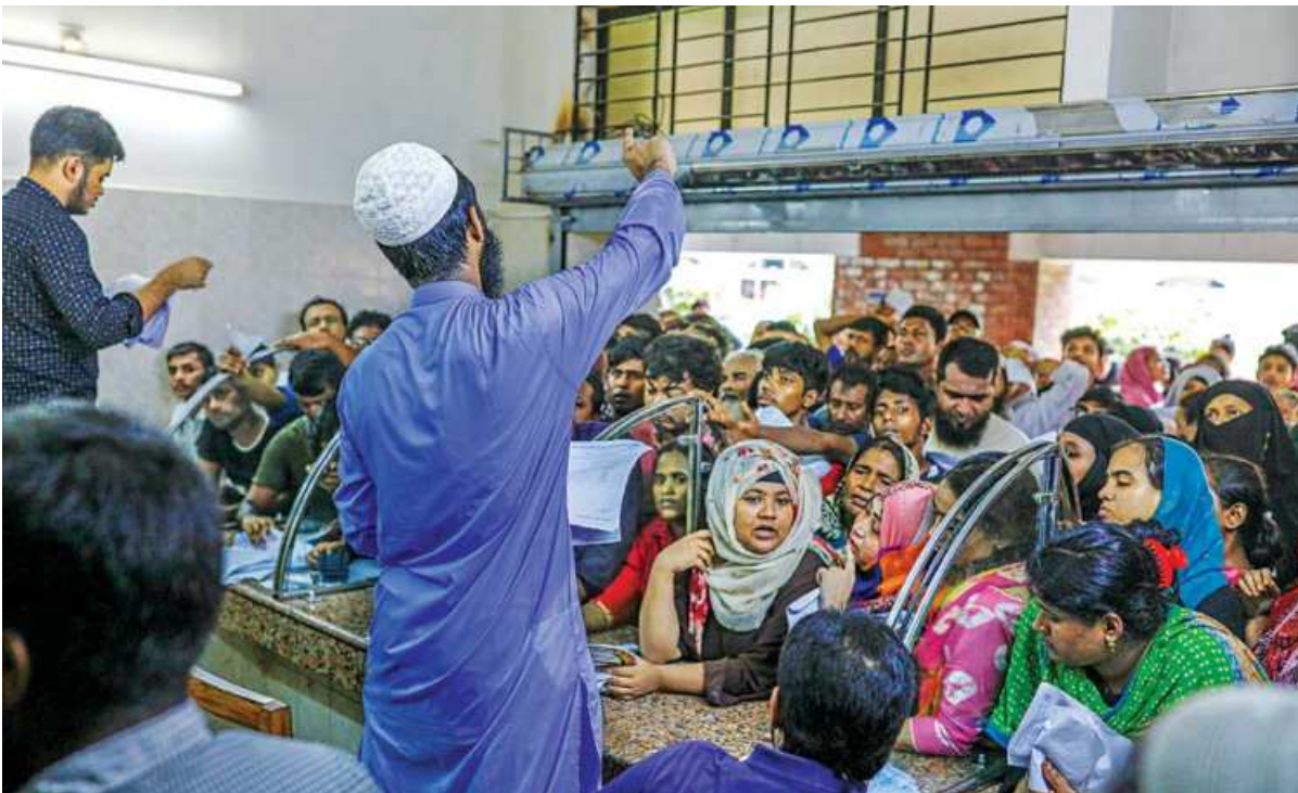
Employees of Shaheed Suhrawardy Medical College Hospital in the capital try to handle the huge crowd that showed up to receive dengue test results yesterday.

With them, at least 43 people died of SEE PAGE 2 COL 4