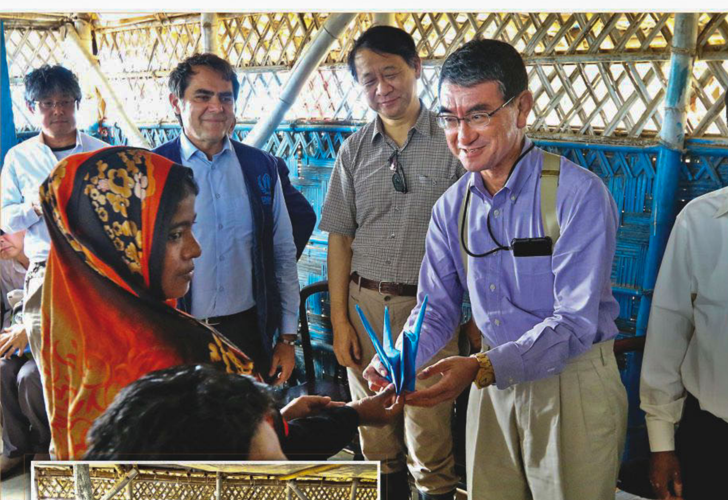
Visiting Japanese Foreign Minister Taro Kono receives a paper flower as a gift from a Rohingya girl as he arrives at a Rohingya camp in Cox's Bazar's Kutupalong yesterday. Inset, the minister talking to some refugees there.