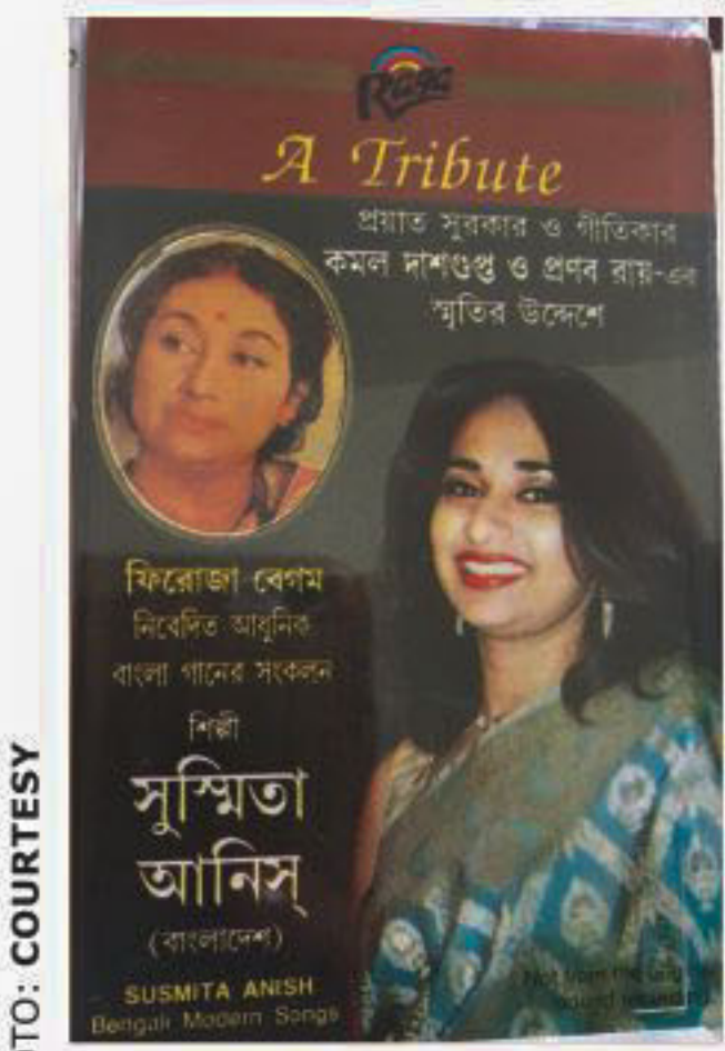
The original album.

"She (Firoza Begum) taught me to sing those songs properly before recording. I am grateful to the creator for giving me the opportunity to sing these songs. I am very happy that I can release the album again on this auspicious occasion," says Shusmita Anis.