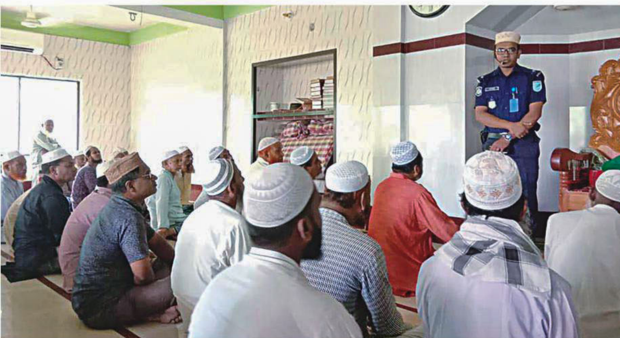
As part of an awareness campaign against rumours of child kidnapping, an official of Bhuapur Police Station in Tangail speaks to people after Juma prayers at Dewanbari mosque yesterday.