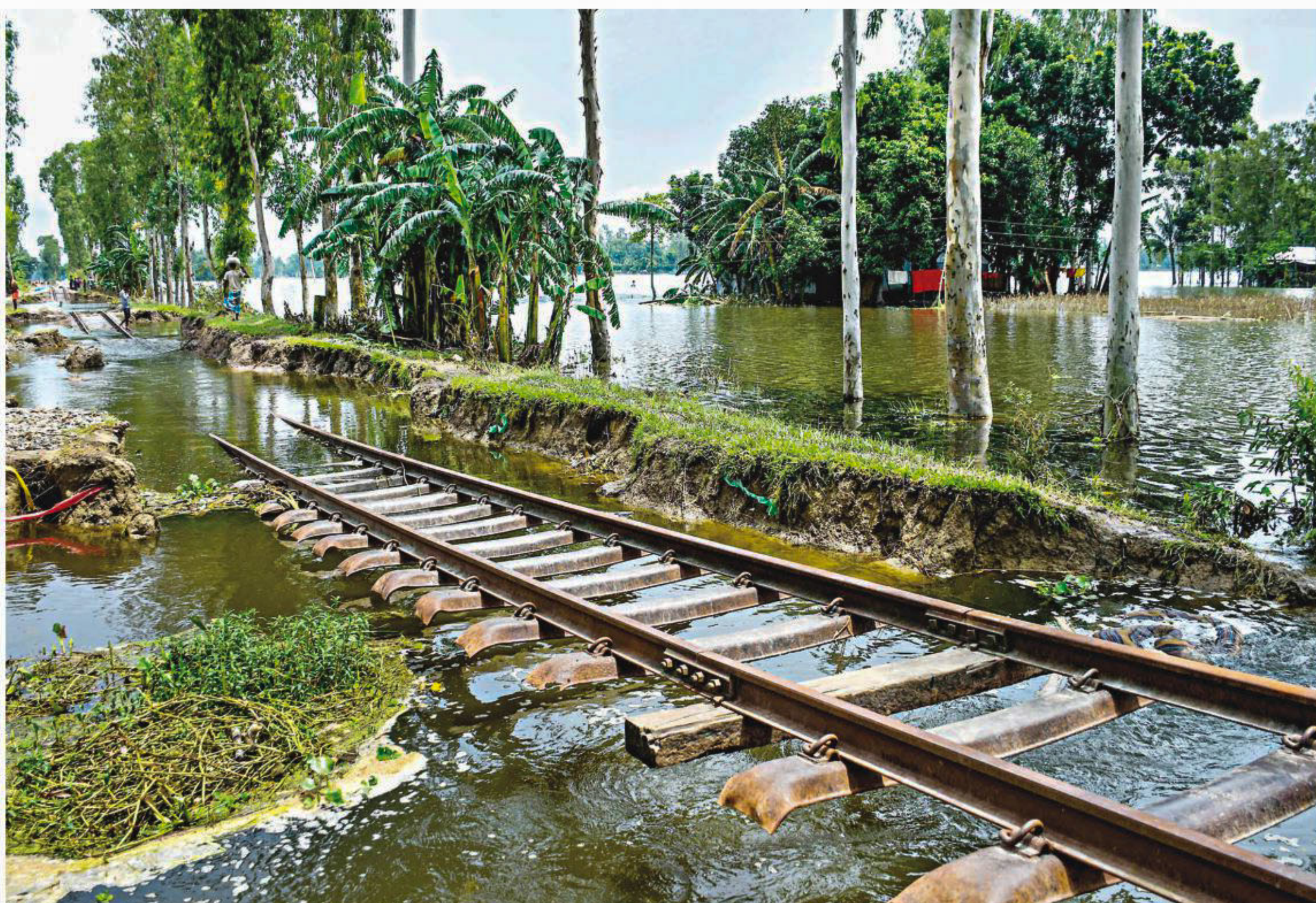
Flooded railway lines in Rifayetpur area of Gaibandha Sadar yesterday. Railway tracks have remained inundated in around 40 such places in the upazila after floodwater breached an embankment of the Brahmaputra river on July 21, disrupting the district's railway communications with other districts.