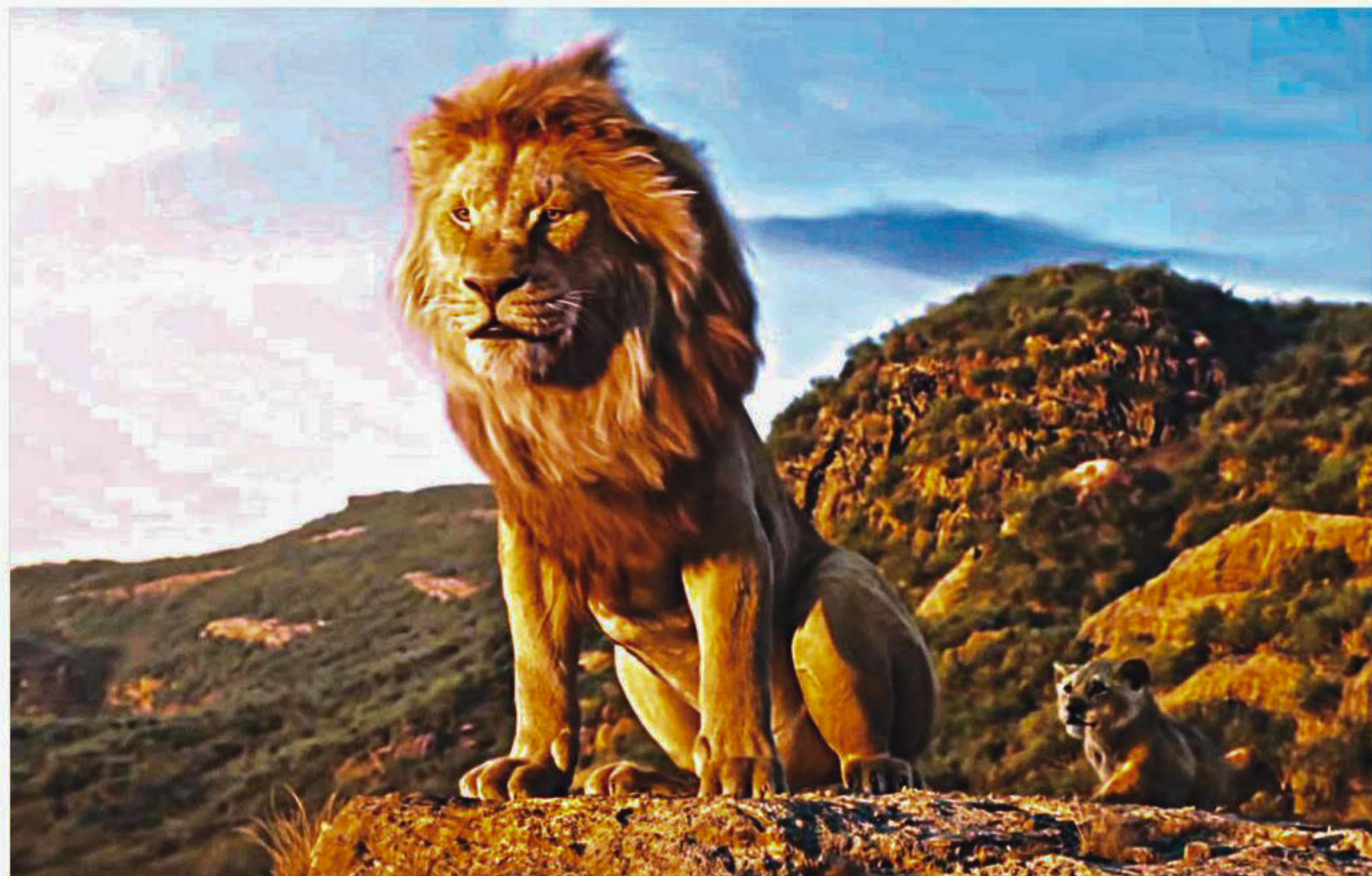
A still from the film.

All in all, the team behind the film does a marvelous job in recreating a masterpiece, aiming not to top it, but to expand it for the new generation of advanced filmmaking technology. Watch it for the story, the music and the scenery. The Lion King hits Star Cineplex today.