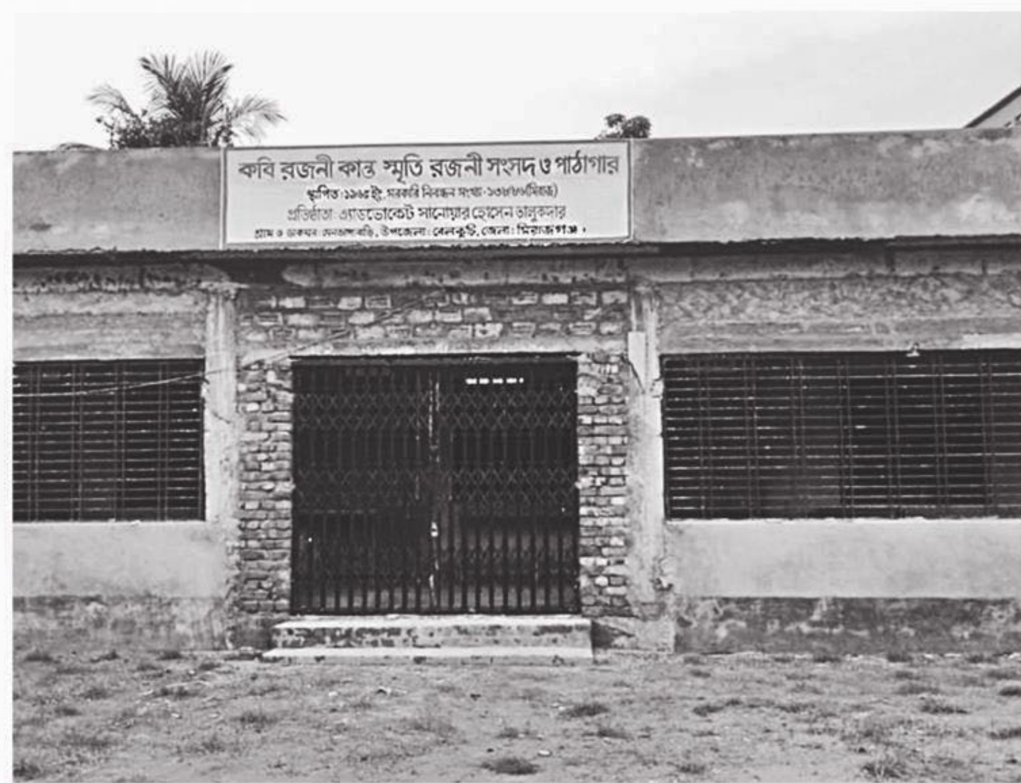
Rajani Sangsad and Library set up at Rajanikanta Sen's ancestral home in Sirajganj's Belkuchi village, and right, an occupied portion of Sen family's property at the village.

Born on July 26 in 1865 to Guru Prasad Sen and Monomohini Debi at Bhangabari village in Belkuchi upazila of Sirajganj, Rajanikanta Sen is considered one of the Pancha-kobi, an elite league of the five major poets-songwriters