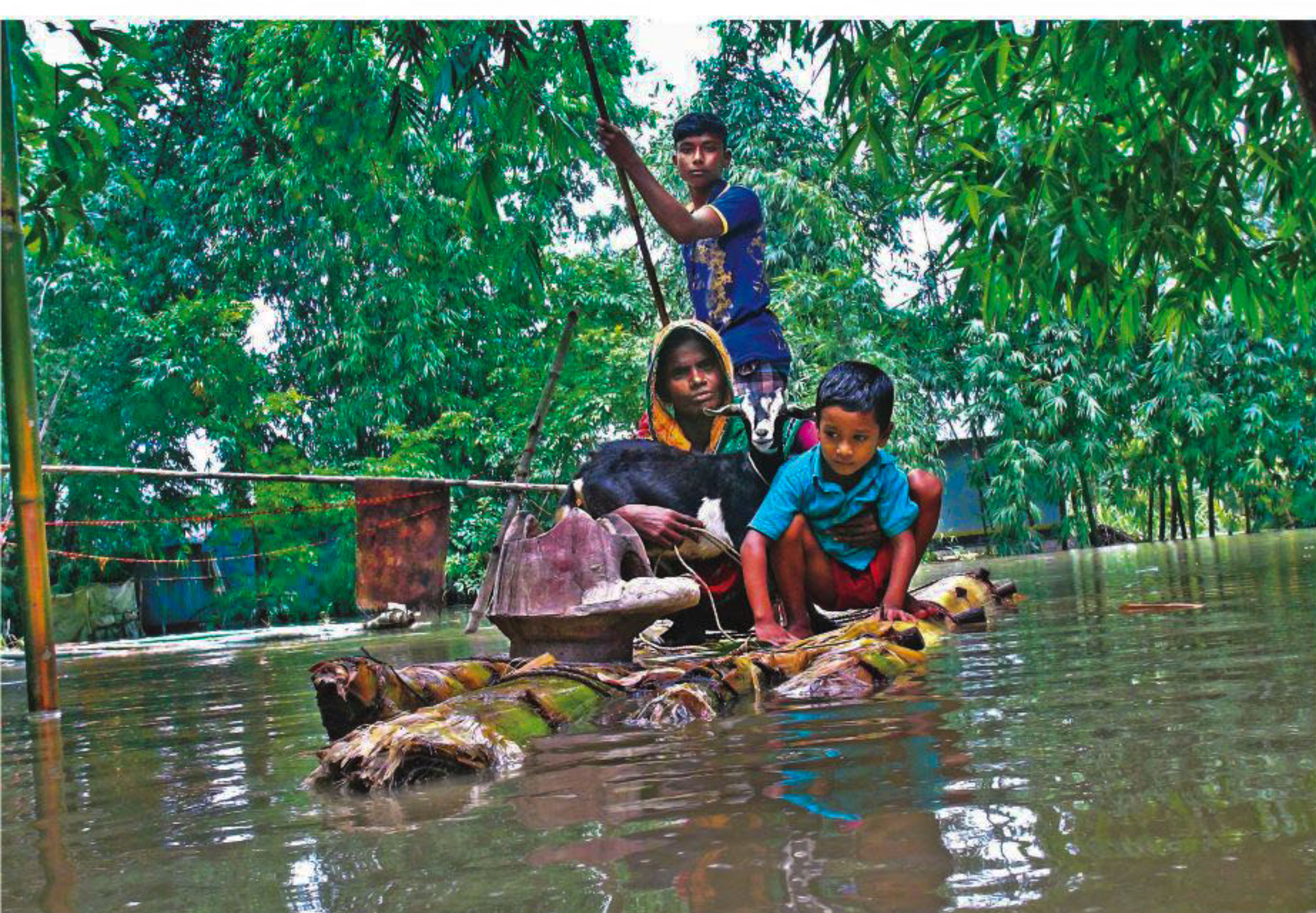
A woman and her two sons leaving their flooded neighbourhood in Lalmonirhat's Shiberkuti with their goat and earthen stove on a raft made of banana trees yesterday.