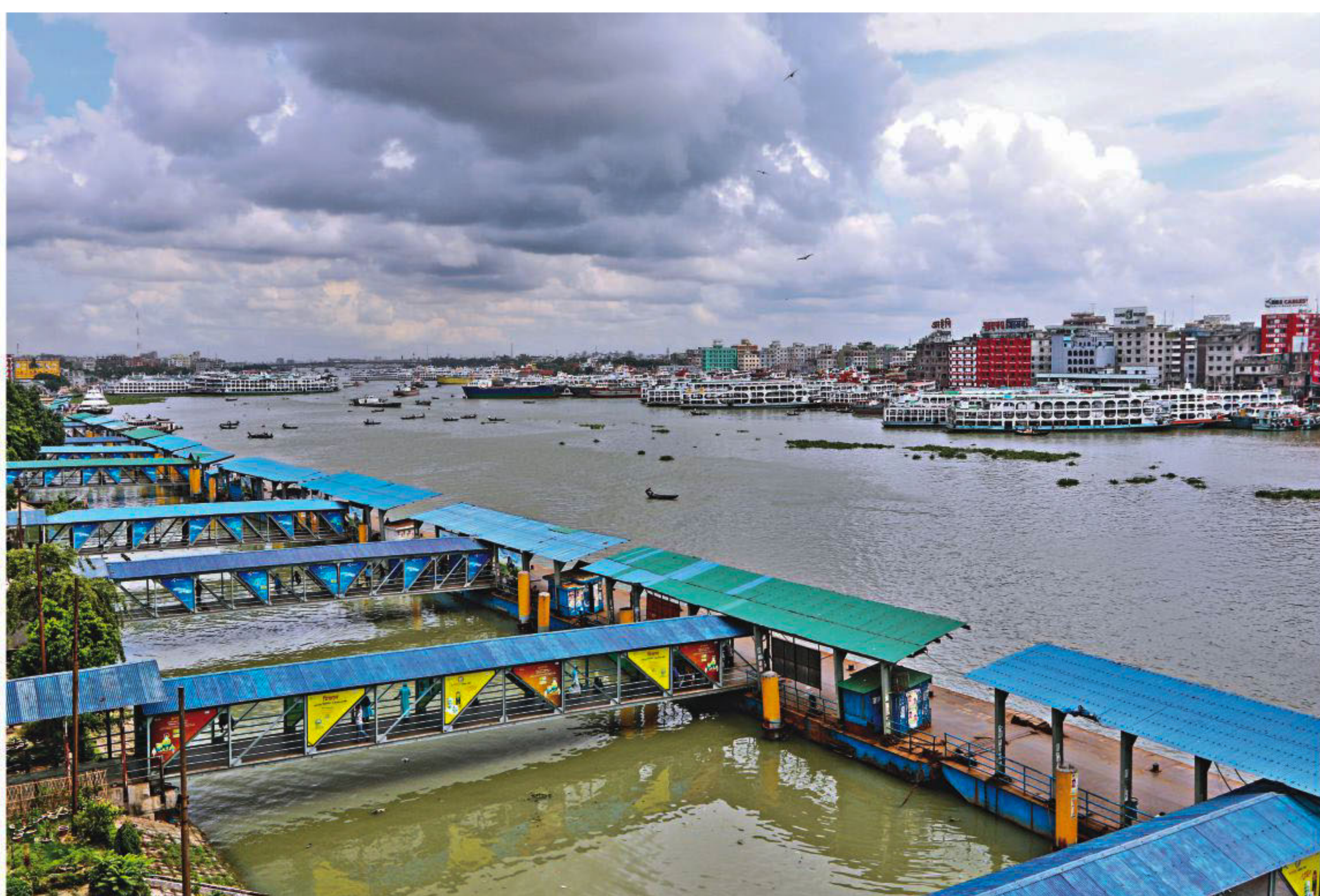
Deserted pontoons in the capital's Sadarghat Launch Terminal during yesterday's strike by water transport owners and workers. Travellers and businesses suffered a lot throughout the day.