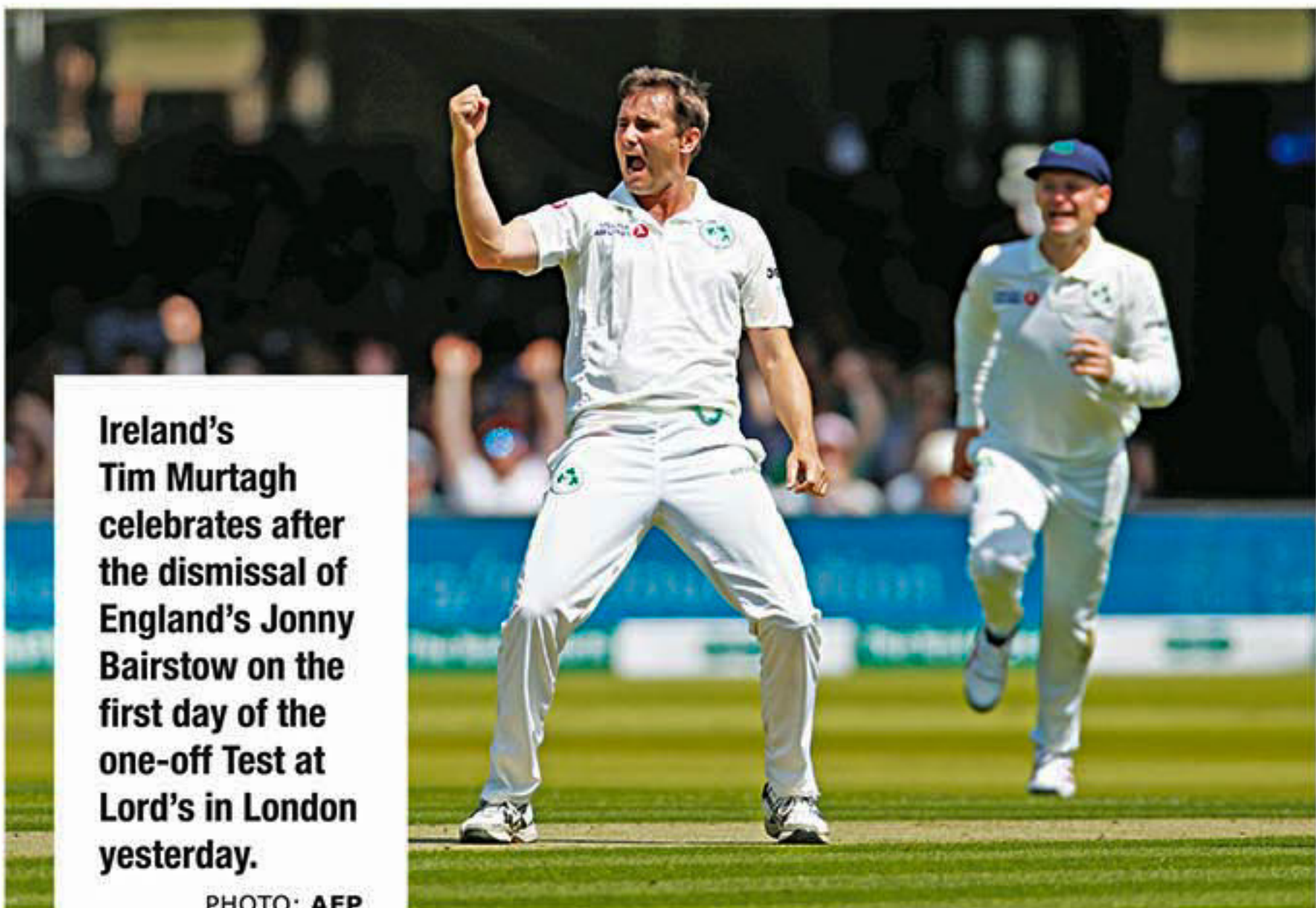
Ireland's Tim Murtagh celebrates after the dismissal of England's Jonny Bairstow on the first day of the one-off Test at Lord's in London yesterday.