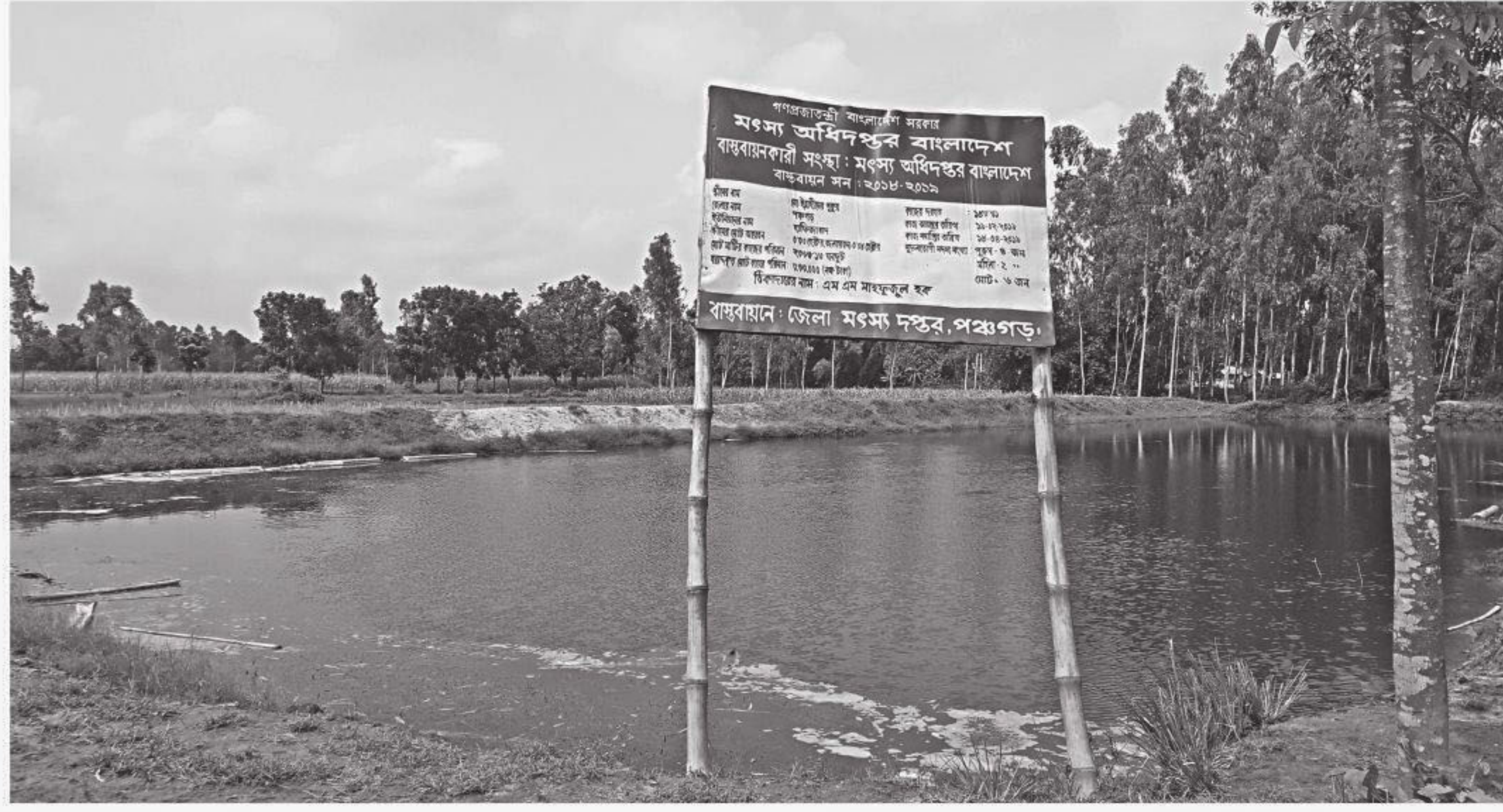
A re-excavated fish pond at Garati village in Panchagarh Sadar upazila.

"Seventeen ponds in the upazila were re-