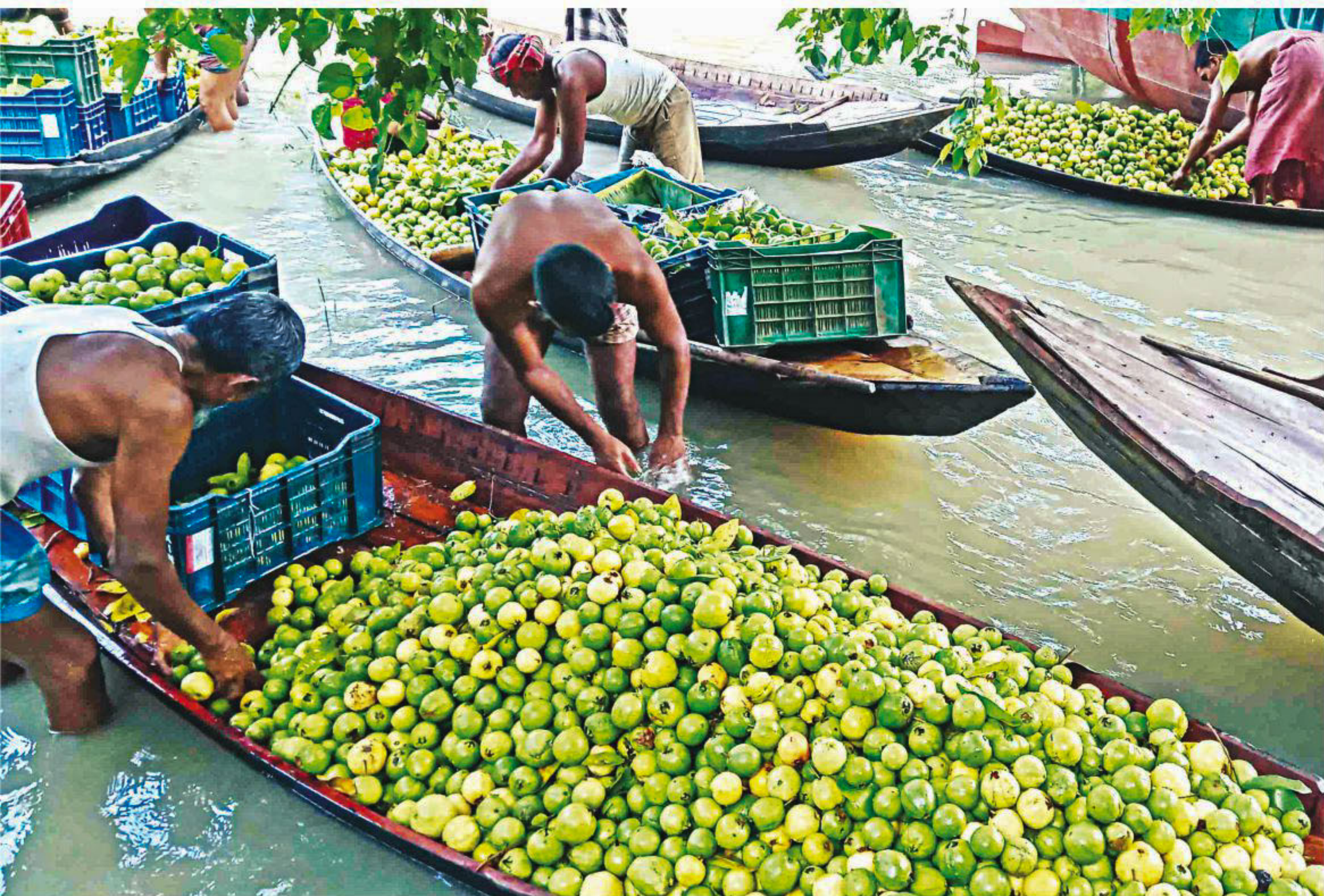
Farmers arrange guavas on boats at Kuriyana floating market in Pirojpur's Nesarabad upazila. Wholesalers from across the country visit different floating markets in the upazila, known for tasty guavas, to buy this nutritious fruit during the harvesting season. The photo was taken on Friday.