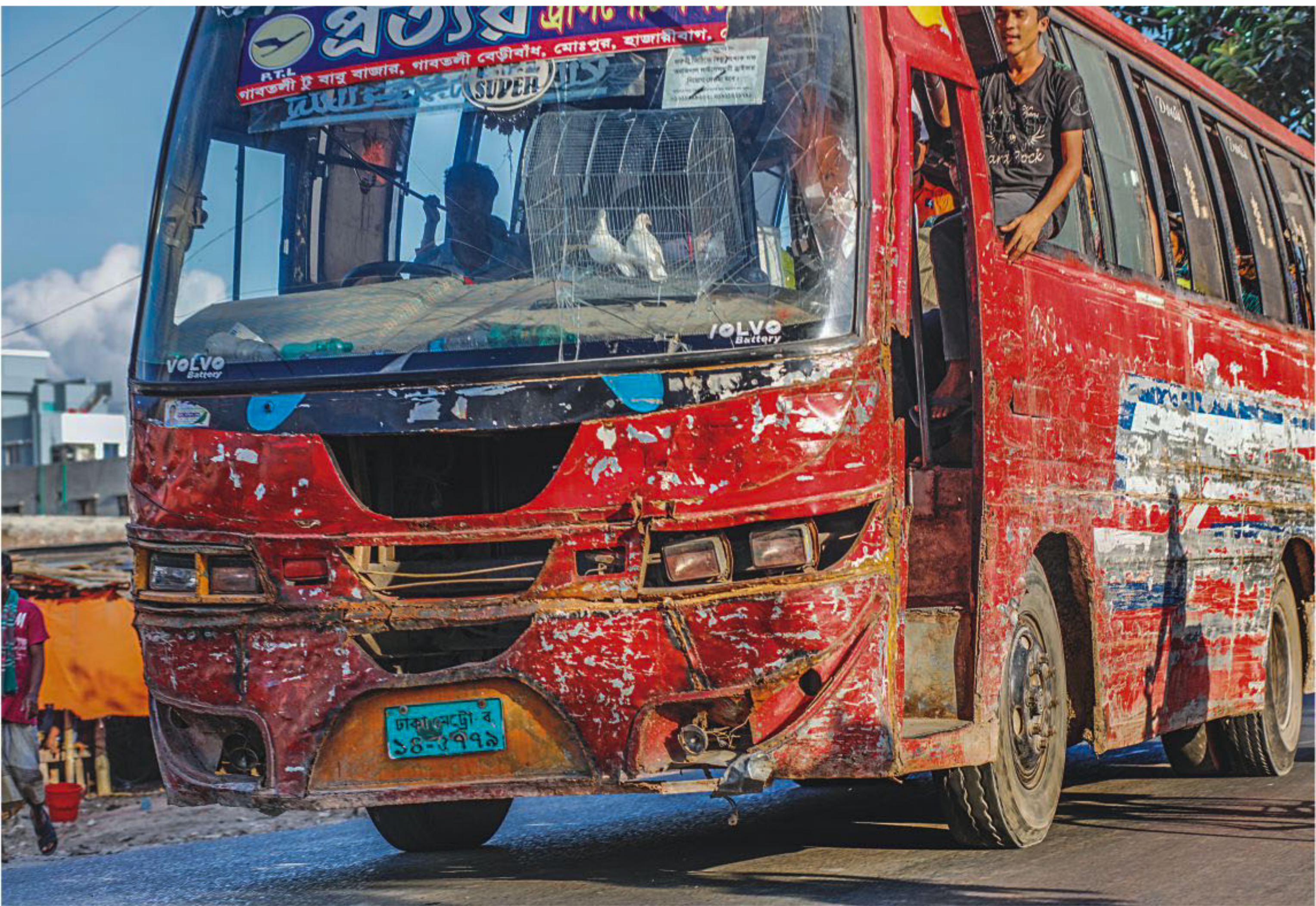
A bus with no rear view mirrors, windscreen wipers, and indicators plying the Mohammadpur Beribadh road in the city's Rayerbazar area yesterday. Although operating unfit vehicles is illegal, such seemingly unfit buses run on obscure routes putting lives at risk.