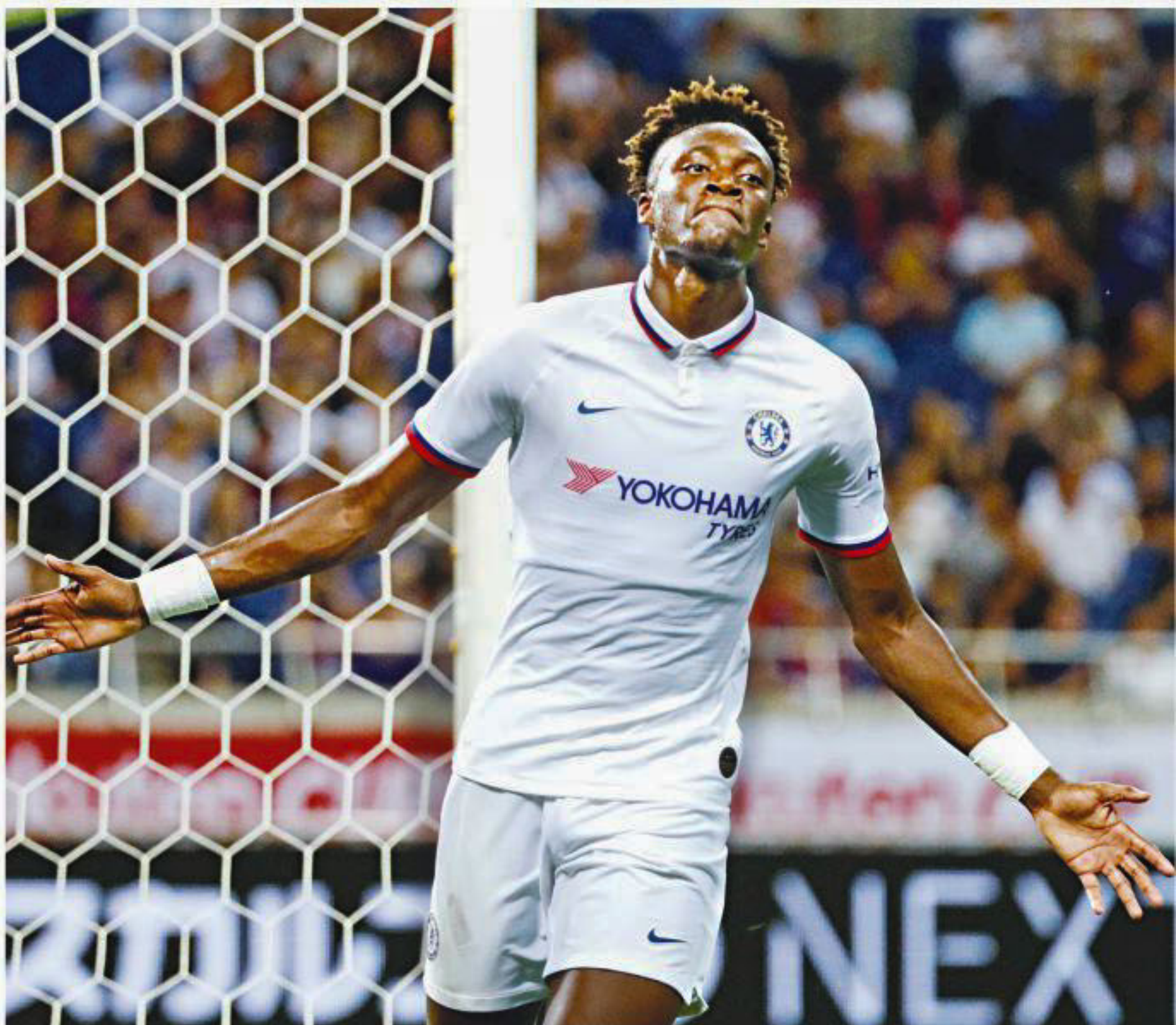
Chelsea striker Tammy Abraham celebrates after scoring the opening goal against Barcelona during their pre-season friendly at the Saitama Stadium in Japan yesterday. Chelsea won the match 2-1.

Interestingly both candidates have been members of the ad-hoc committee which ran the game's governing local body in the last two years, but there was hardly any improvement in athletics during that period.