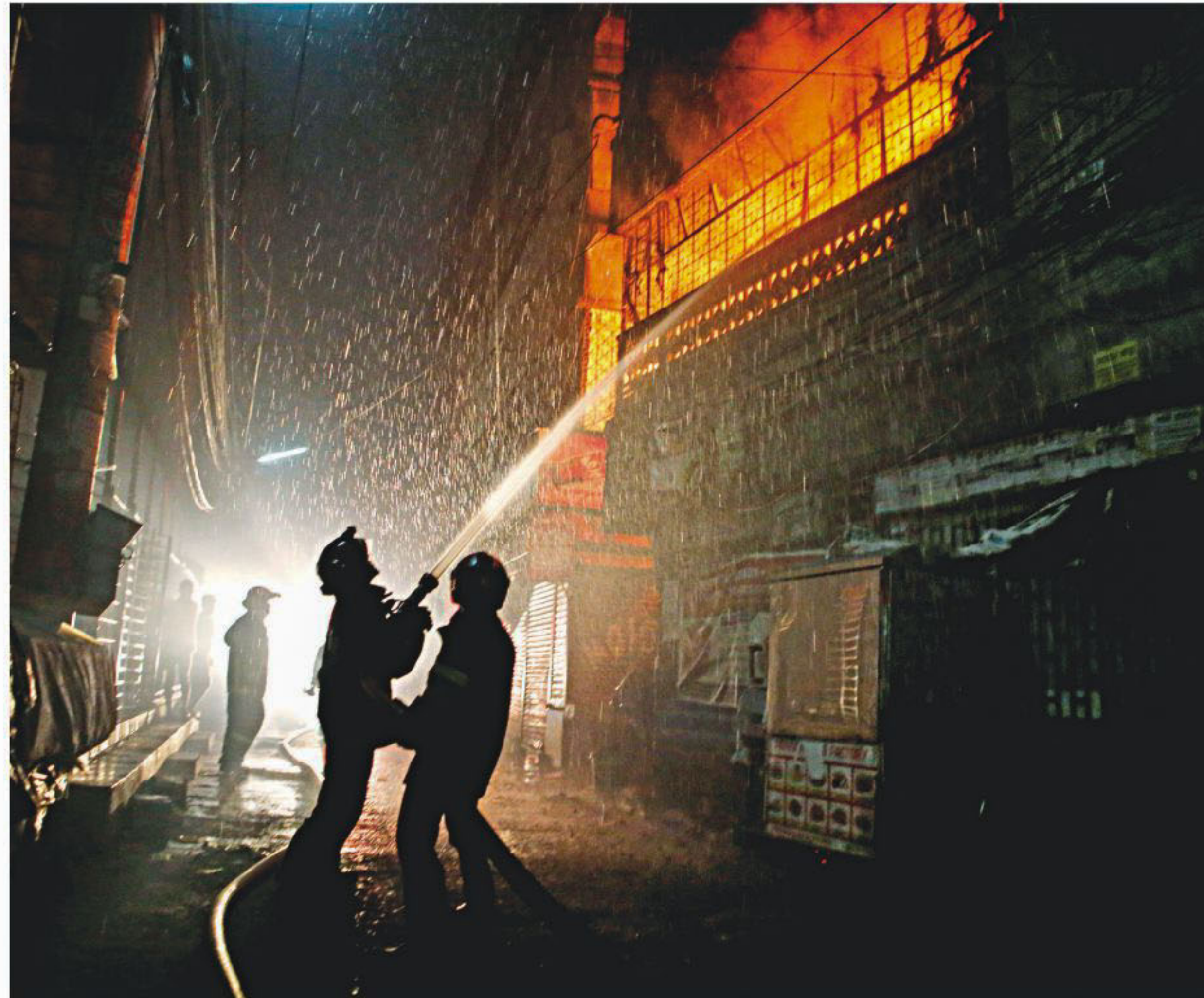
A fire broke out on the second floor of Nibedika Hostel at the capital's West Tejuri Bazar early yesterday. One student got injured while trying to escape the five-storey building in a hurry. On information, fire service deployed four units to the spot and were able to douse the flames by 5am.