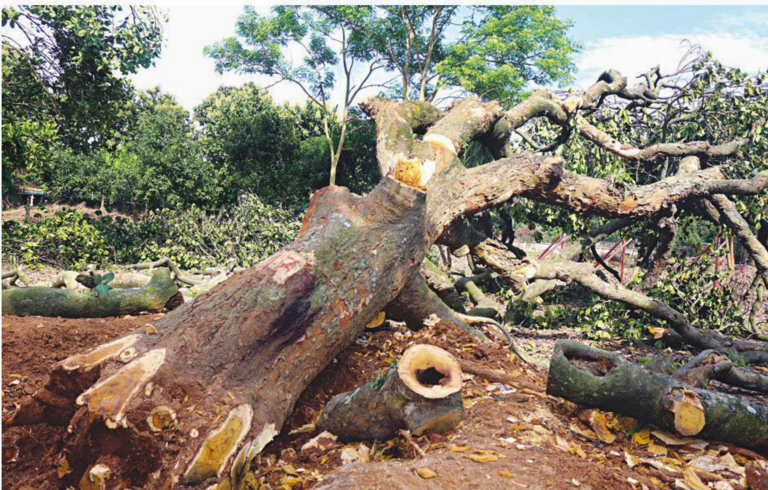
This tree is one of 1,100 that are being felled to build six ten-storey dormitories in Jahangirnagar University's Tarzan Point. Despite protests from teachers and students, construction companies cut down marked trees. The photo was taken yesterday.

The victim's mother filed a case accusing her husband.