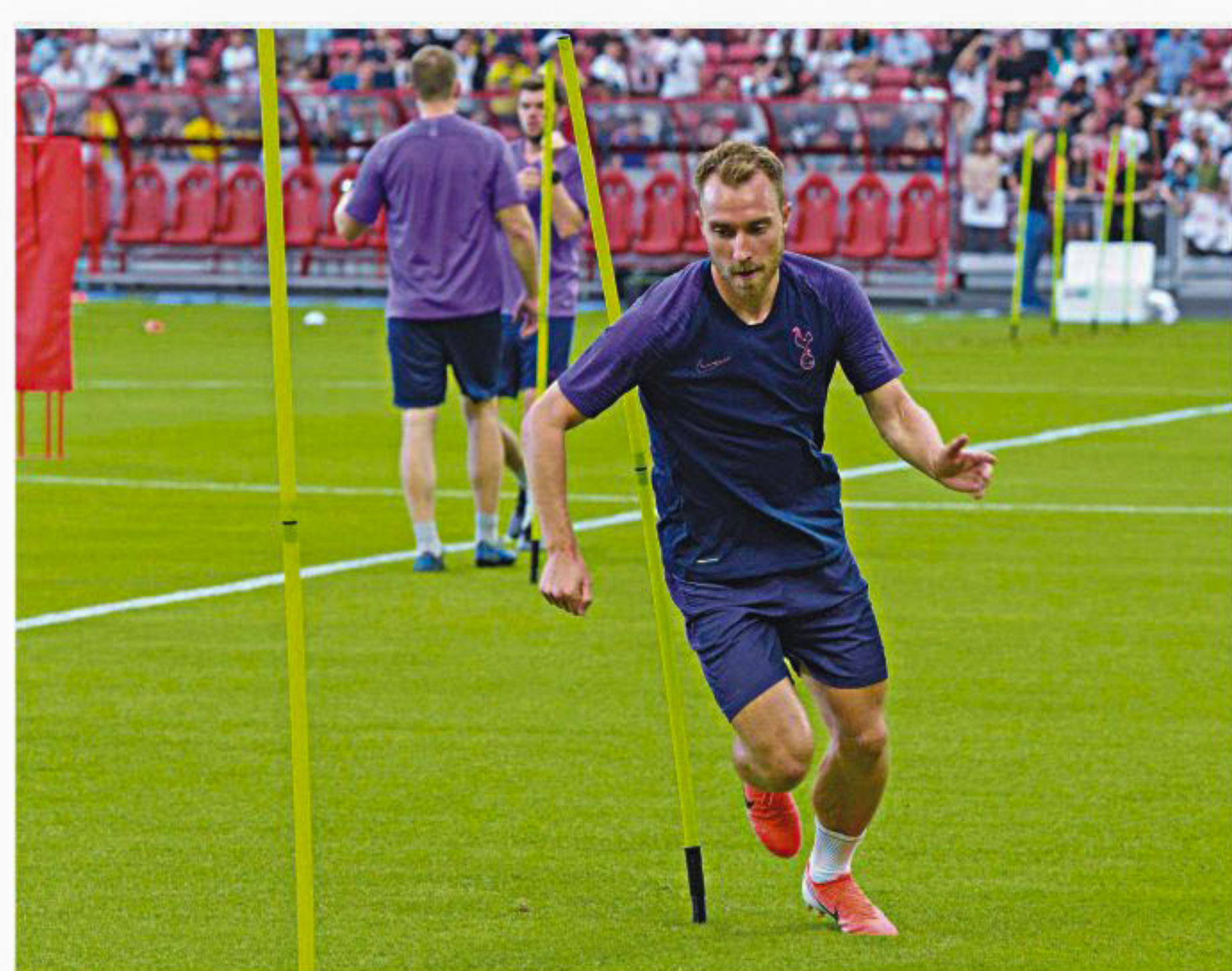
Tottenham Hotspur playmaker Christian Eriksen warms up during a training session in Singapore yesterday ahead of the International Champions Cup.

Last month, the Denmark international said he was ready to take on a new challenge. Argentine manager Mauricio Pochettino told reporters Eriksen trained alone due to a "minor surgery" the playmaker underwent after Tottenham lost 2-0 in the Champions League final.