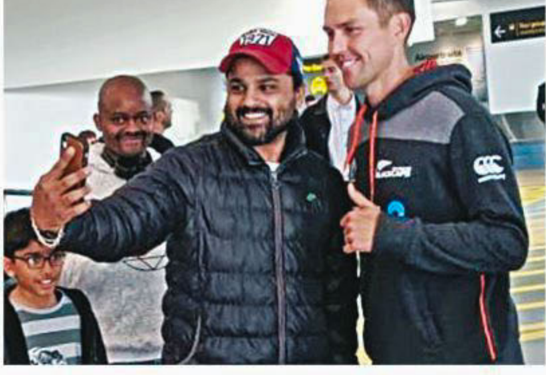
New Zealand pacer Trent Boult (R) takes a selfie with a fan after arriving at the Auckland Airport yesterday.

"I didn't really know what to say. Obviously, we're all hurting and we're sorry for letting everyone down. I just want to get home, walk my dog along the beach and try to forget about it but it's gonna be a hard one to swallow for the next couple of years."