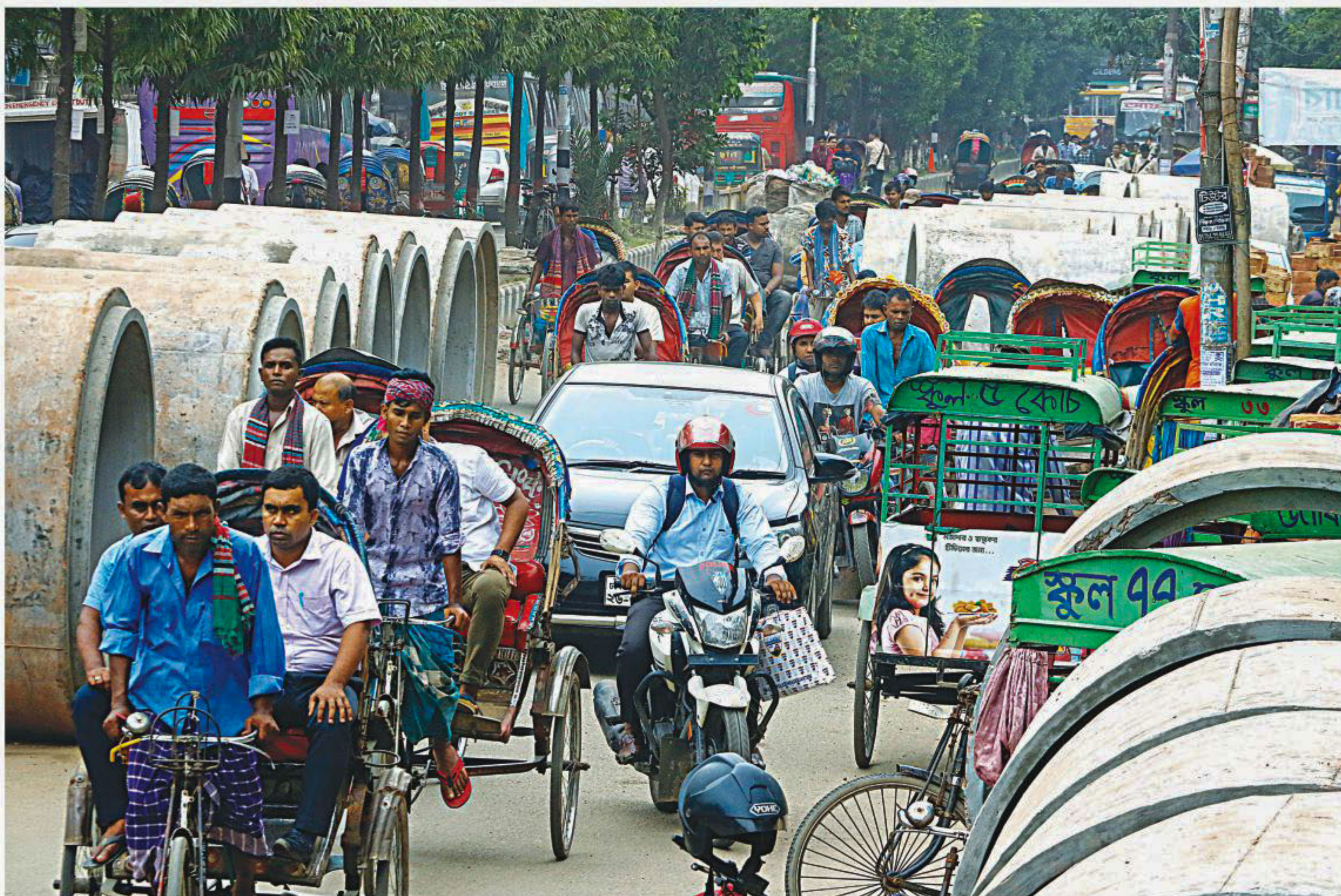
Stormwater drainage pipes have narrowed down this street in the capital's Motijheel, causing frequent traffic jams. Dhaka South City Corporation authorities kept them there around a week ago. The photo was taken yesterday. See City in Frame on page 16 for more.