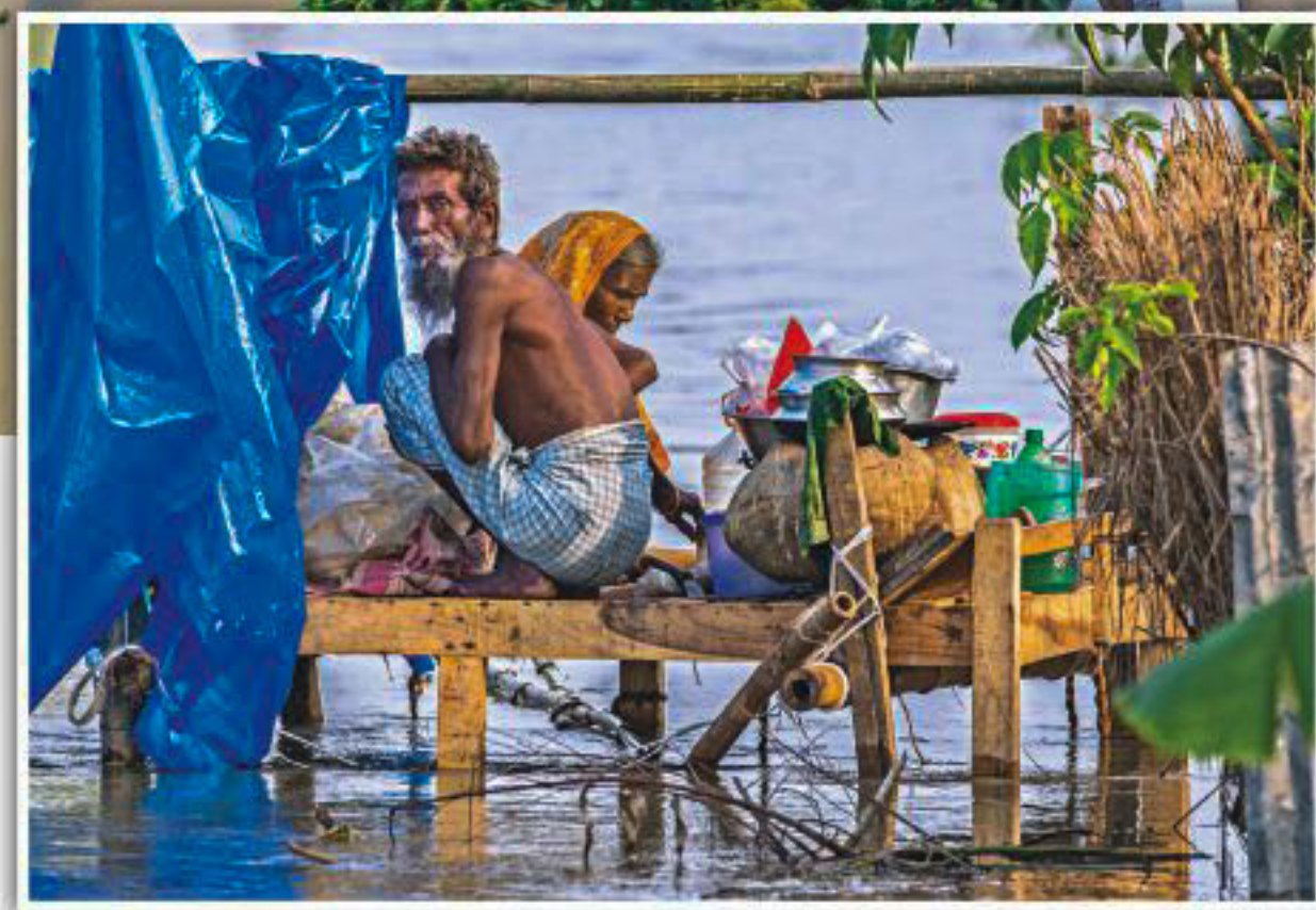
This aerial photo taken on Tuesday shows an entire village in Bogura's Sariakandi upazila inundated. Inset, an elderly couple takes refuge on a rickety structure as almost all their belongings are under water. They cook, eat, and sleep there. Story on page 16.