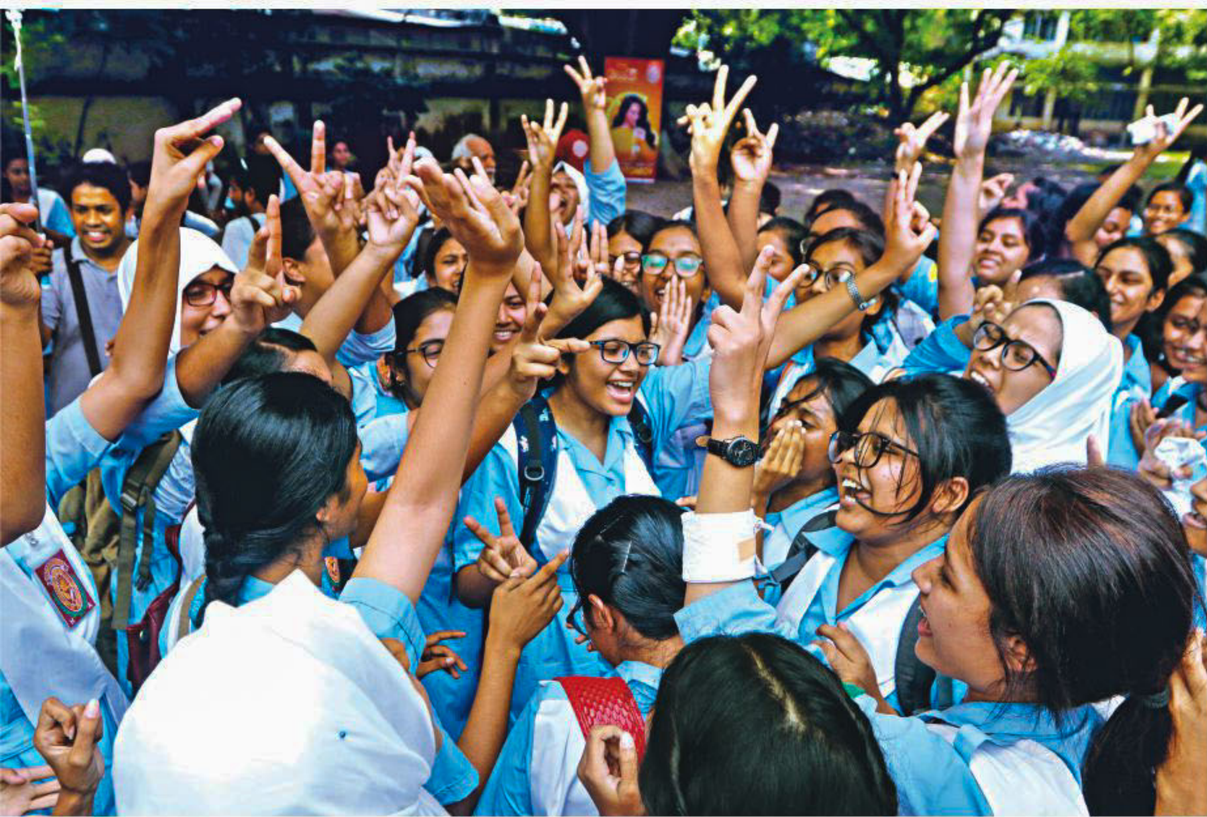
Students of Vigarunnisa Noon School & College celebrate on their Siddheswari campus yesterday after HSC results were out. Many of them achieved GPA 5.

HSC results show number of GPA-5 achievers also higher this year