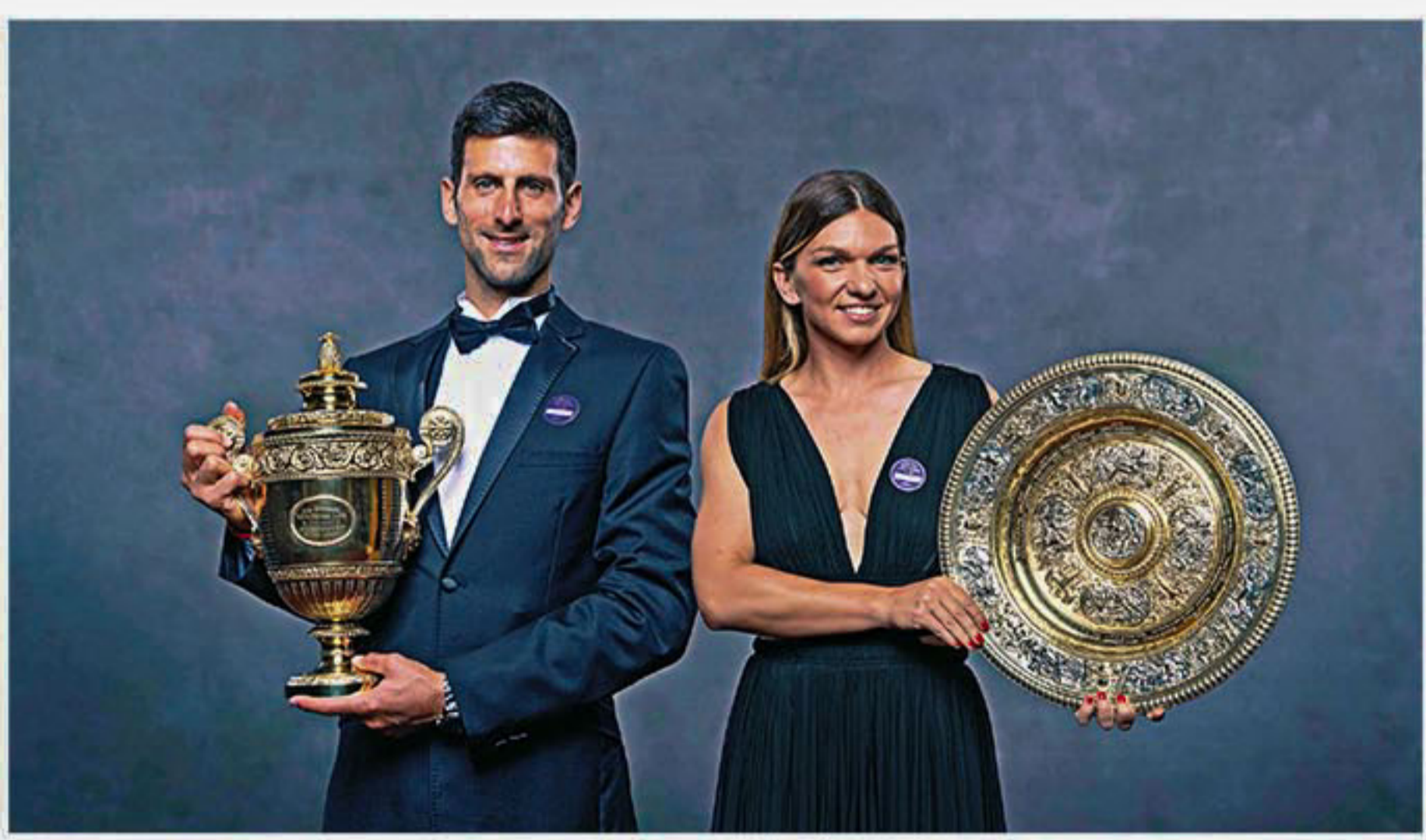
Serbia's Novak Djokovic (L) and Romania's Simona Halep (R) pose with their respective Wimbledon trophies at the champions' dinner in London on Sunday.