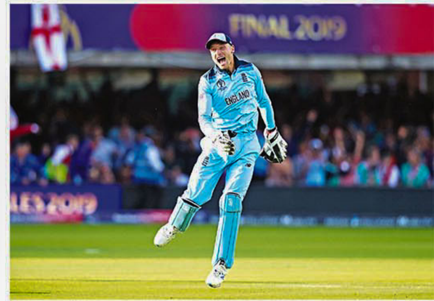
After a nailbiting finish in the final of the 2019 ICC Cricket World Cup, England were on the winning side for the first time. England's young pacer Jofra Archer kept New Zealand to 15 runs, helping the hosts win on boundary-count. Wicketkeeper-batsman Jos Buttler effected the last run-out before England captain Eoin Morgan proudly lifted the trophy.