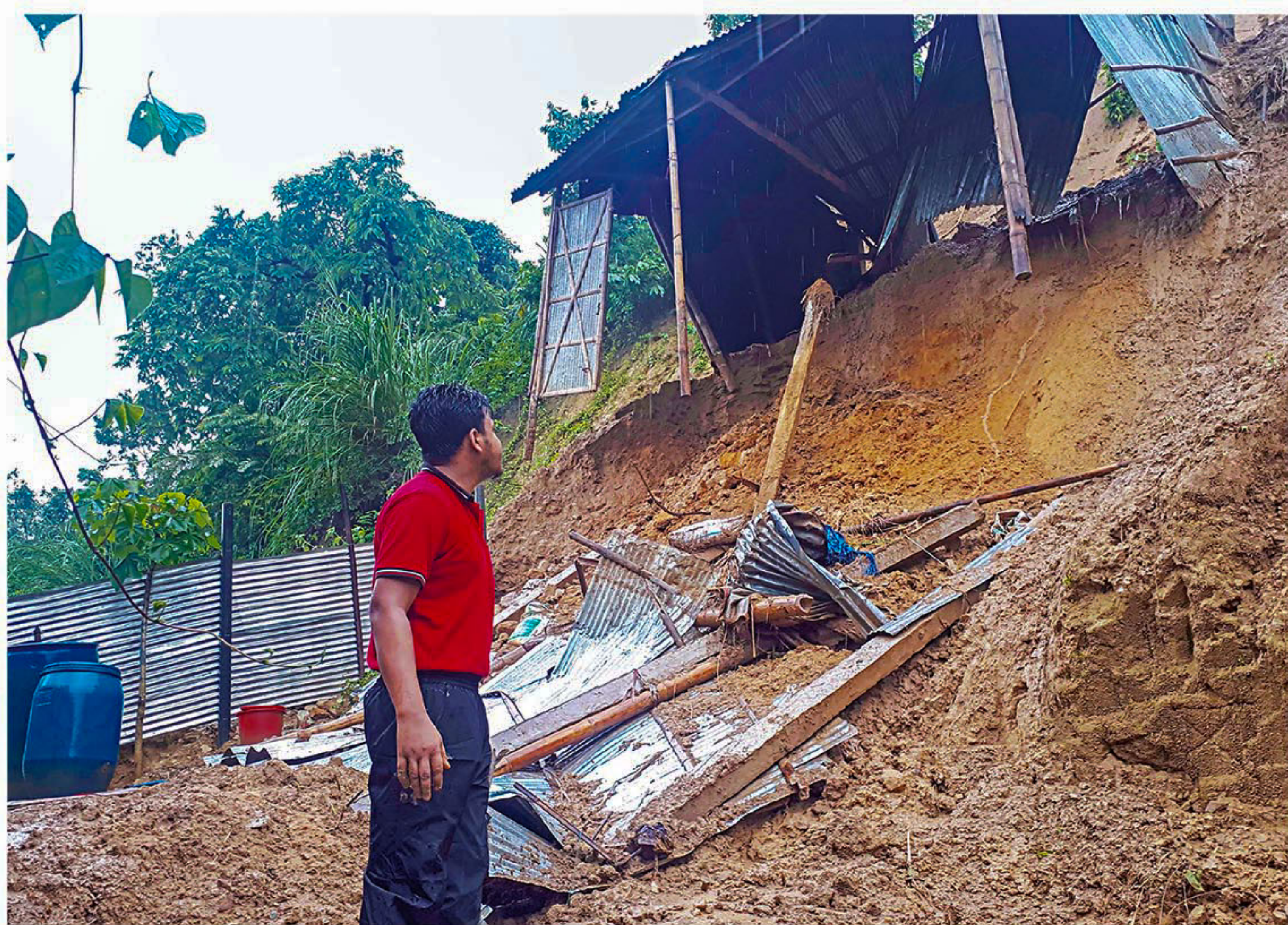
A man looks at the remains of a tin shack wrecked by a landslide amid continued downpour in Arefin Nagar area of Chattogram yesterday.