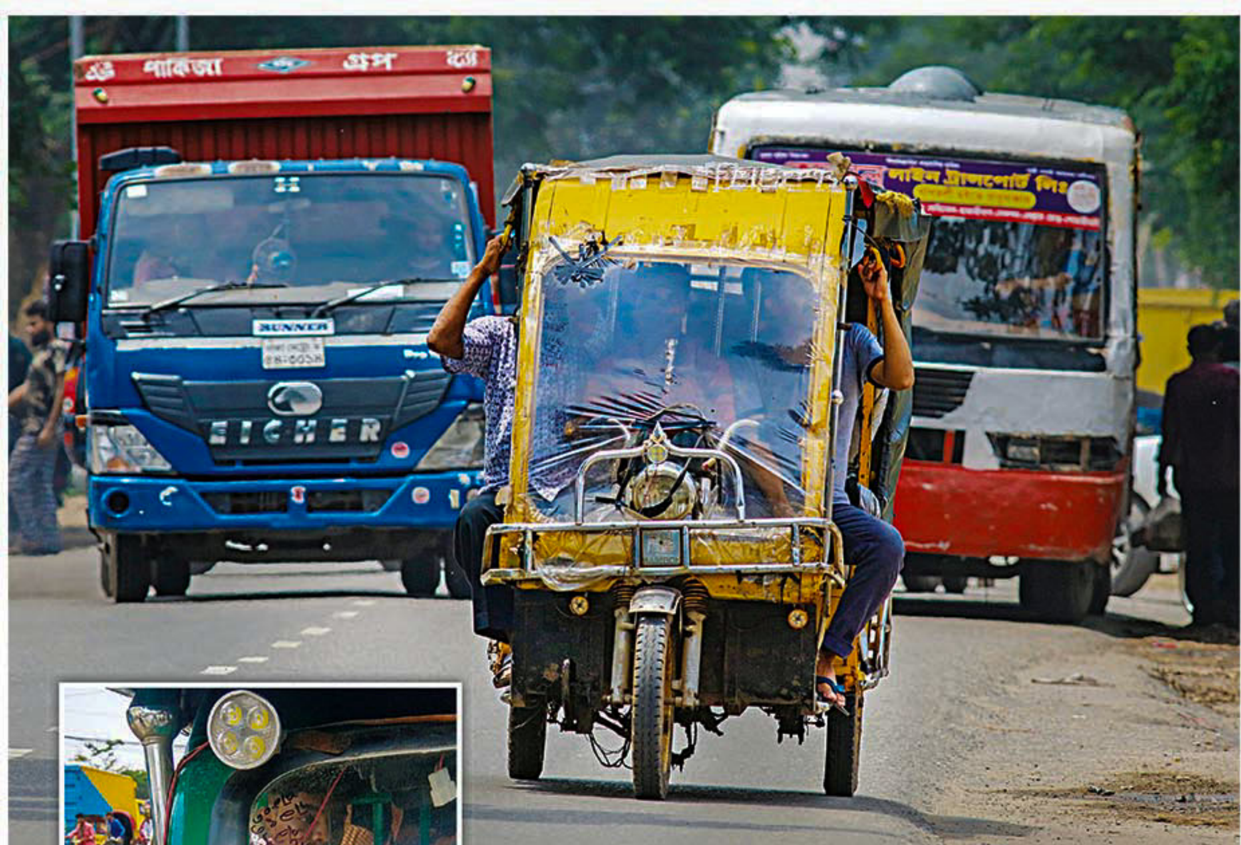
A battery-run three-wheeler plying the Beribadh road in the capital's Hazaribagh. Although such vehicles are prohibited, a section of transport-worker leaders takes money from the drivers and allows such vehicles on road. Inset, a windshield marked with codes that serve as clearance for plying. The photos were taken recently.