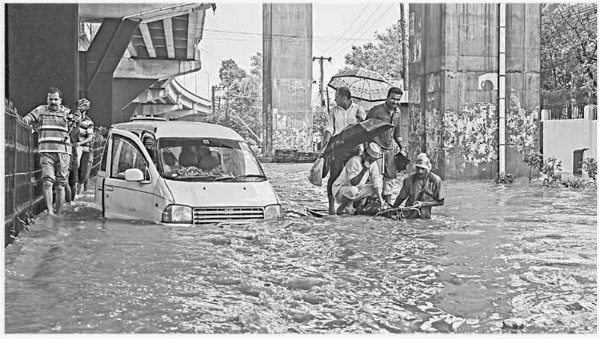
Passengers step out of a vehicle after it broke down on this flooded road yesterday. Meanwhile, three people travel on a completely submerged rickshaw-van with the puller wading through waist-deep water. The photo was taken in Sholashahar Gate-2 area.

Following yesterday's rain, most low-lying areas including Chawkbazar, Bakalia, Sholakbazar, Agrabad, Halisahar, Muradpur, Bahaddarhat, Kapasgola, Prabartak Intersection, KB Aman Ali Road, DC Road, Chandgaon, Sholashahar Gate-2, East Nasirabad and Dewanbazar went under knee- to waist-deep water. People were seen wading through filthy water to go to their destinations. Some were busy protecting their homes and shops from water while others were trying to drain and scoop water out.