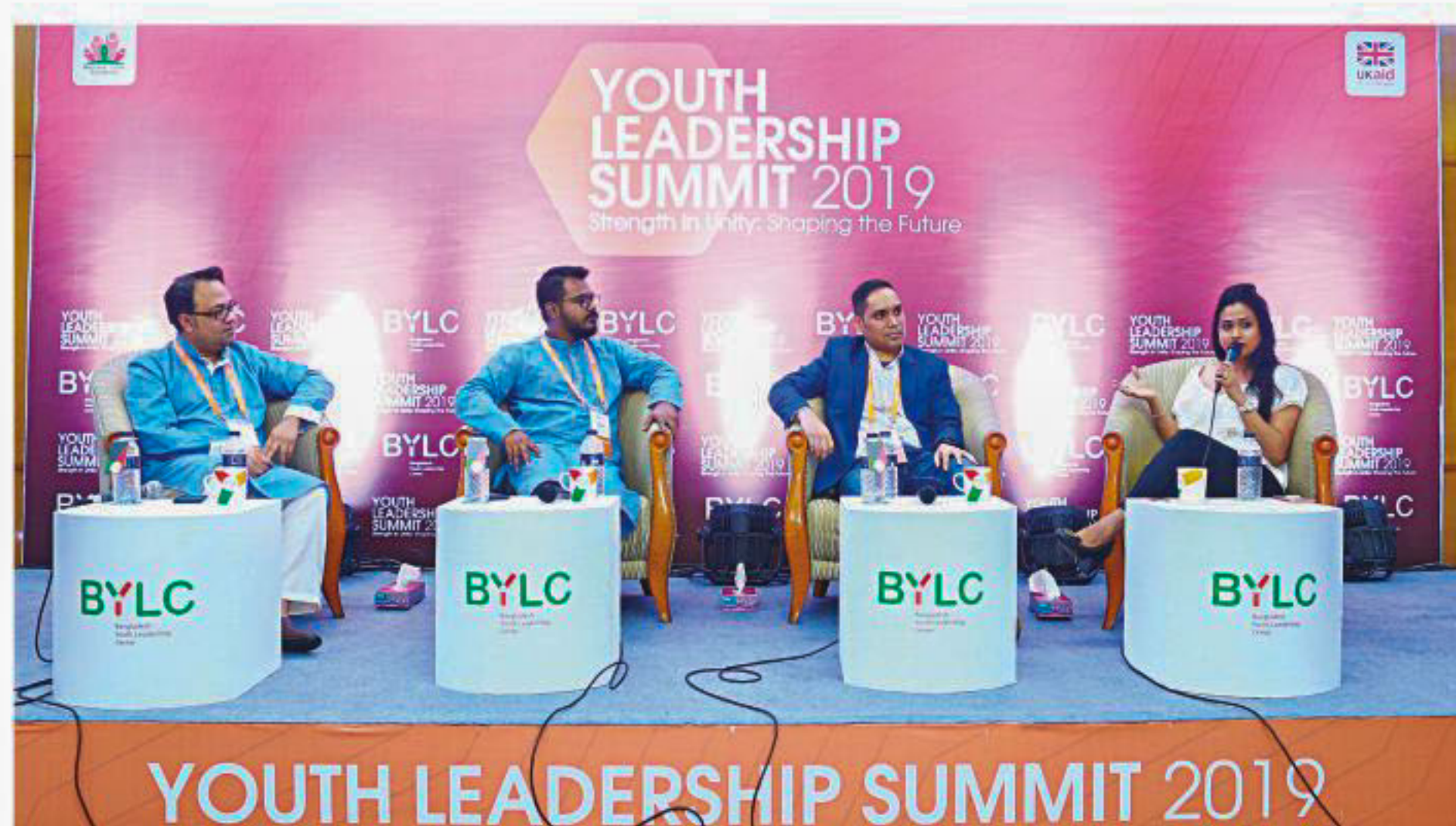
The summit focused on how youths can prepare themselves to start their own venture.