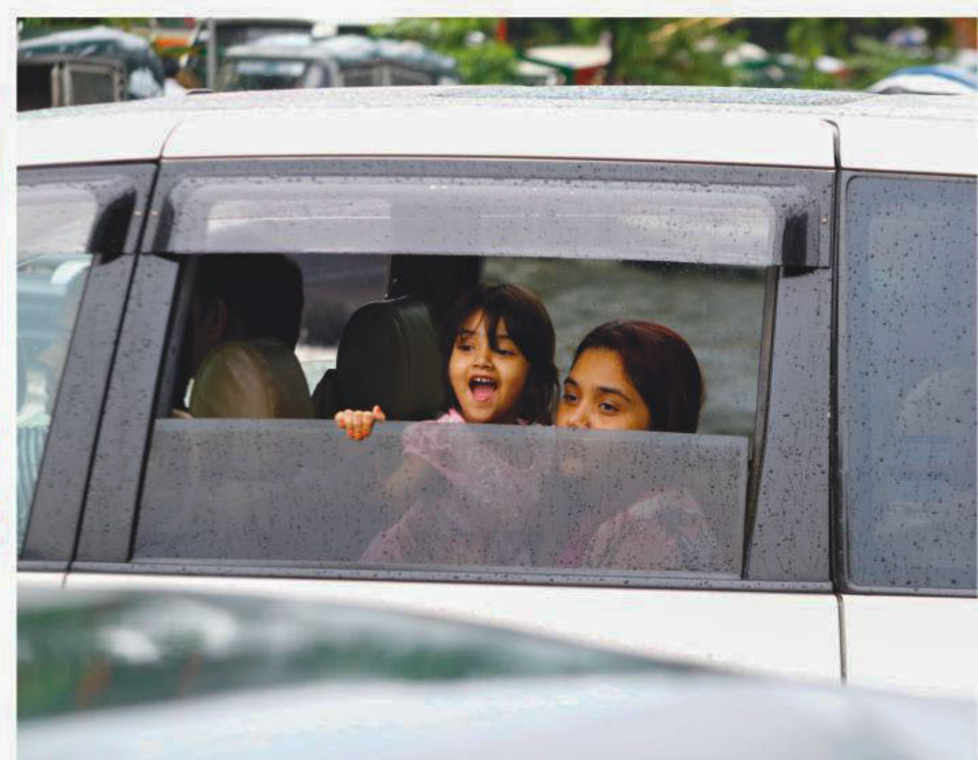
Left, an umbrella placed under the roof of DCC market in Karwan Bazar did not really help stop rainwater from seeping in. Even though rain disrupted city life yesterday, this little girl was thrilled by the droplets of water, wind in her face and fresh earthy smell, while their vehicle remained stuck in traffic on Mirpur Road near Dhanmondi 27.