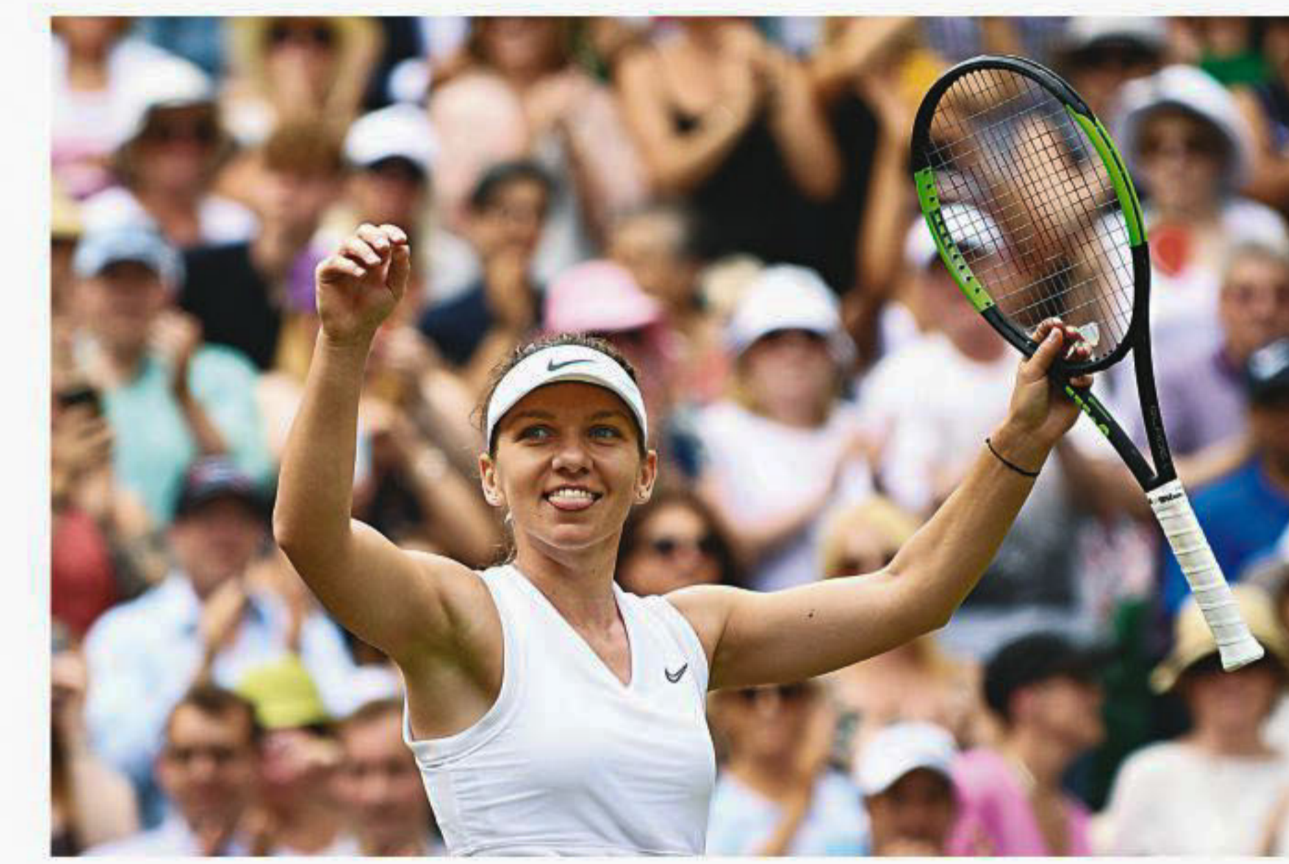
Simona Halep celebrates after securing a 6-1, 6-3 win over Elina Svitolina in a Wimbledon semifinal match yesterday.

Simona Halep became the first Romanian woman to reach the Wimbledon final on Friday but then found herself answering questions -- about snooker. The 27-year-old has 288,000 followers on Twitter. However, she only follows two -- former coach Darren Cahill and three-time snooker champion Mark Selby. "I have no idea how you play snooker. But I appreciate him," said Halep.