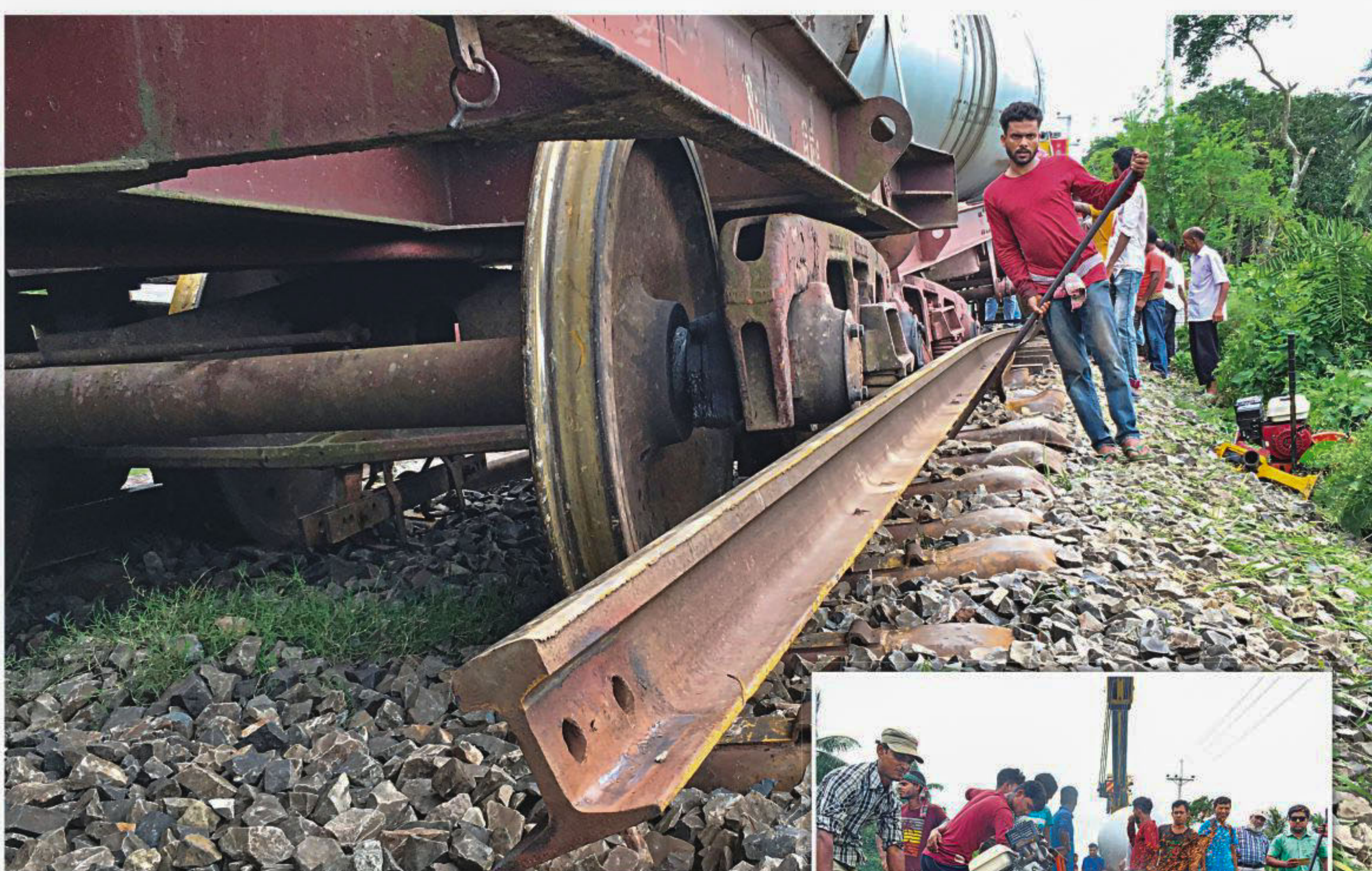
Railway staffers working to restore railway lines where an oil-carrying train derailed in Rajshahi's Chargat upazila on Wednesday. The photo was taken yesterday.