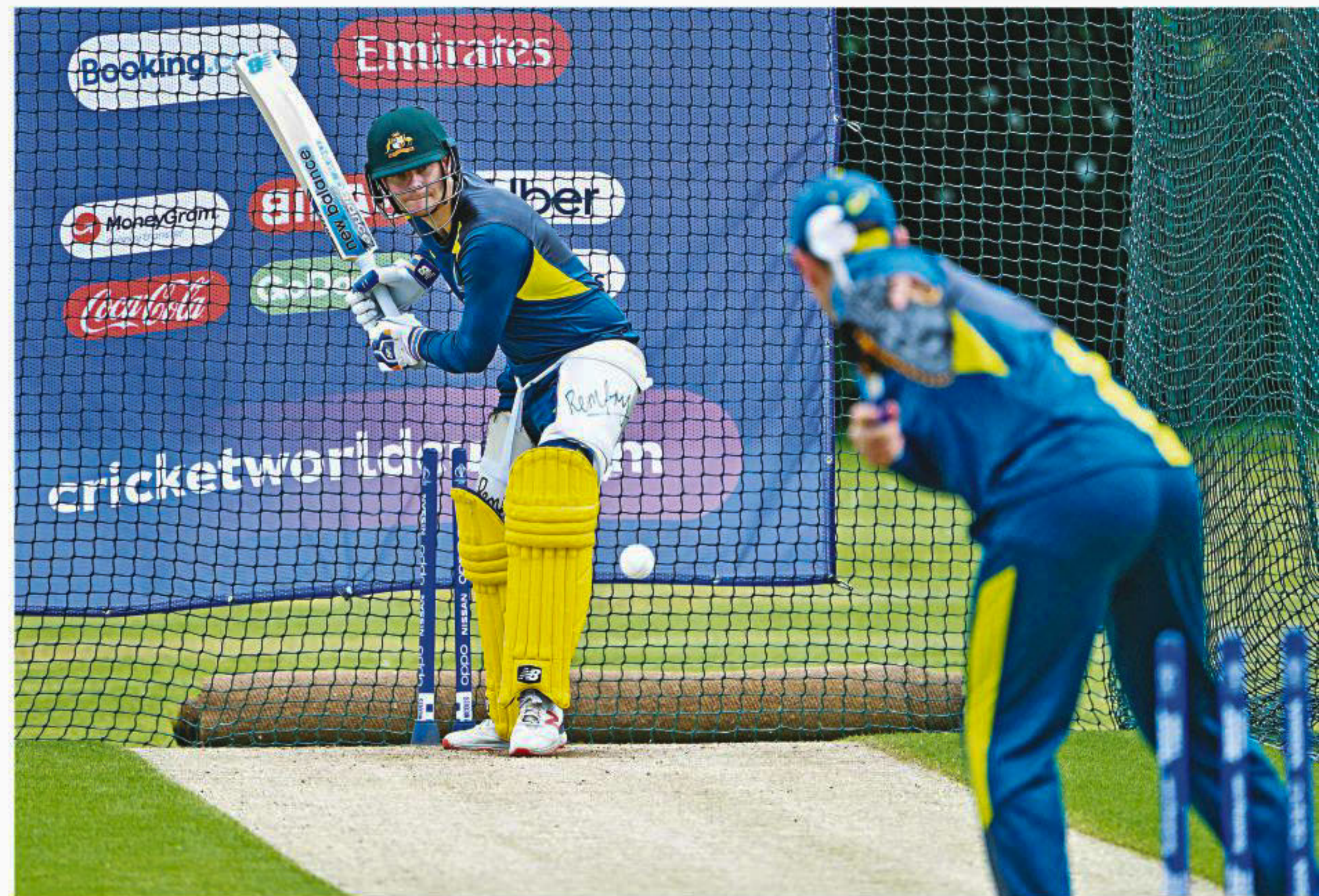
All-rounder Ben Stokes (L) helps England top-order batsman Joe Root do some stretches. England will be hoping that some of Stokes's form can rub off on Root. Australia batsman Steve Smith (R) has his eyes set on the ball as he prepares for the semifinal tie against England today. He will be looking to get back amongst the runs as Aussies eye the World Cup final.