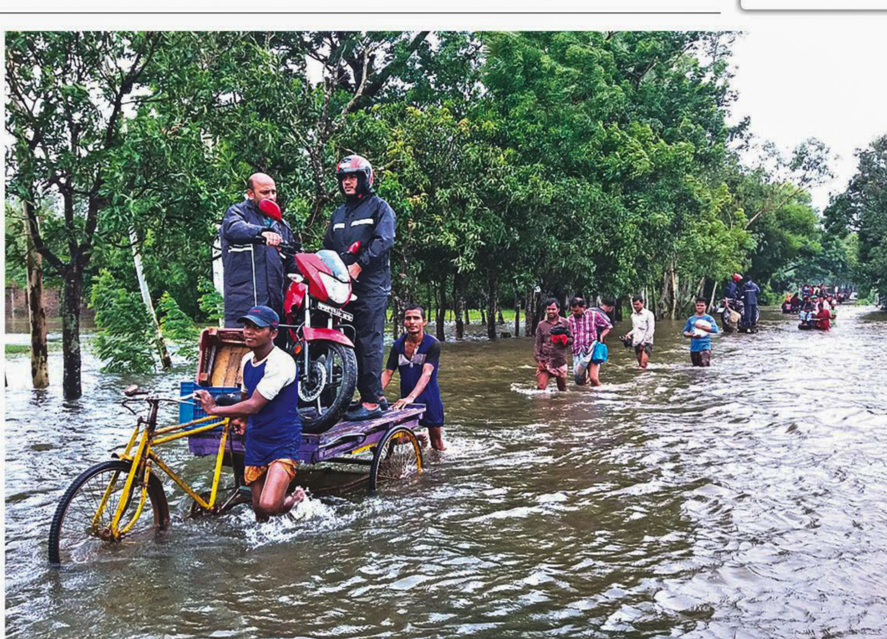
A man pulls a motorcycle and two bikers on a cart on a waterlogged part of Bandarban-Chattogram highway in Bajalia area yesterday afternoon.