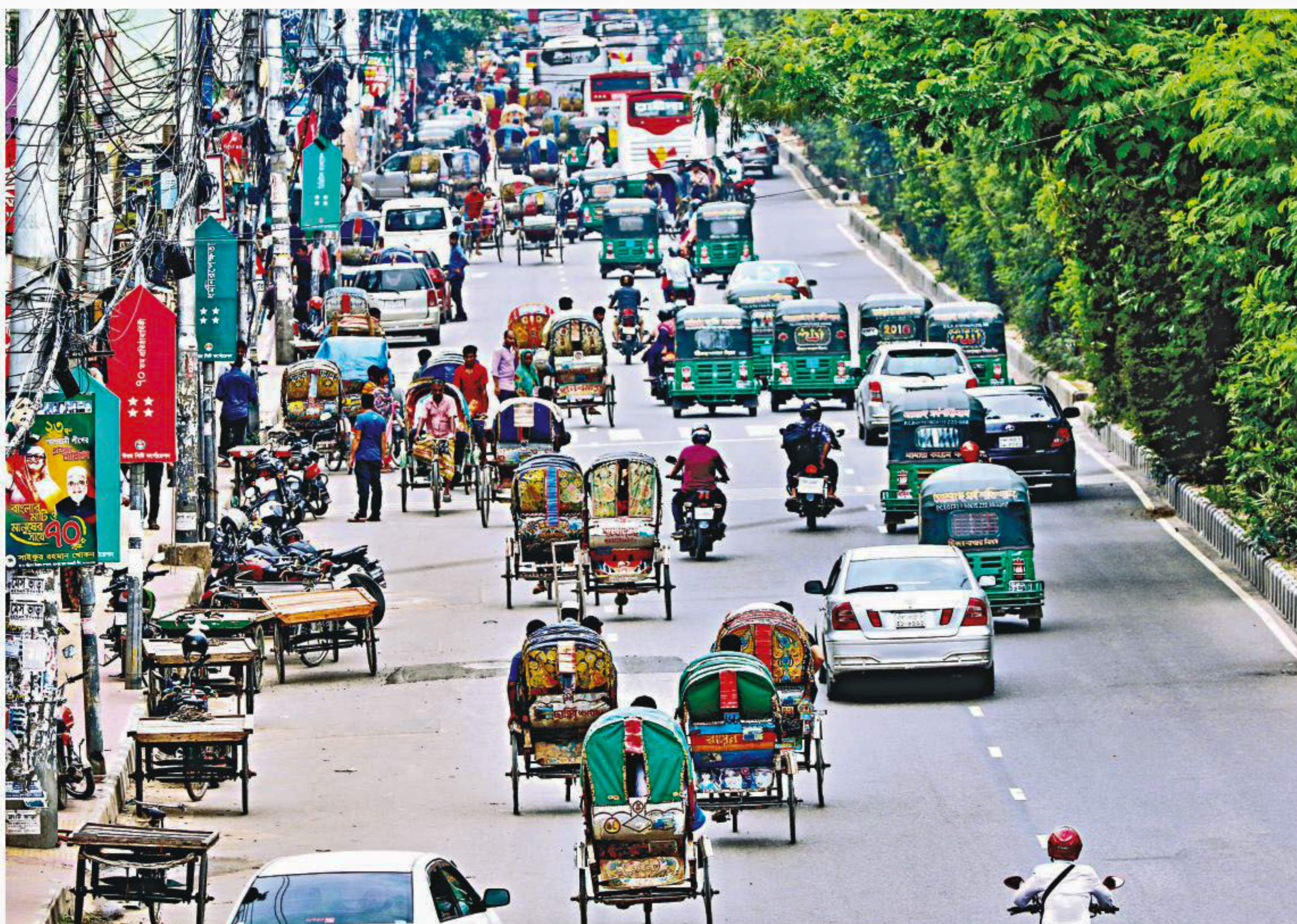
Rickshaws plying the DIT Road in Rampura yesterday after the authorities relaxed the ban on rickshaws on three major roads including this one.