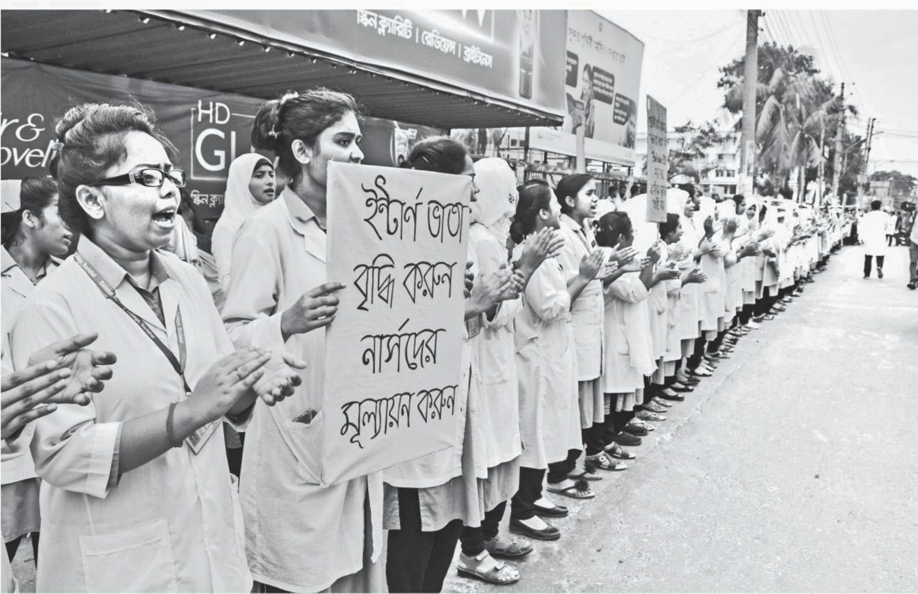
Bangladesh Basic Graduate Student Nurse's Association organised a human chain in front of Sher-e-Bangla Medical College Hospital with a four-point demand, including a raise in remuneration for interns.