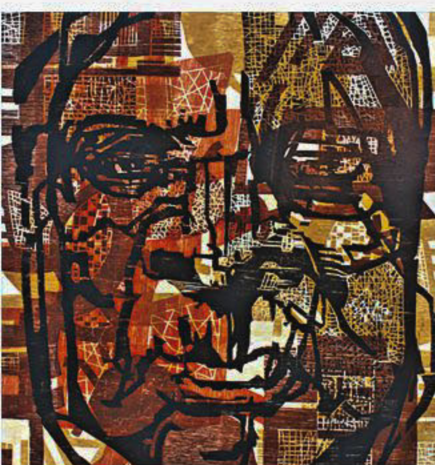
'Portrait of Ambiguity', Woodcut.

Poetry show Title: Poetry Night at 3rd Space Date: July 11 Time: 5 pm Venue: Counter Culture Club, Dhanmondi Entry: Free