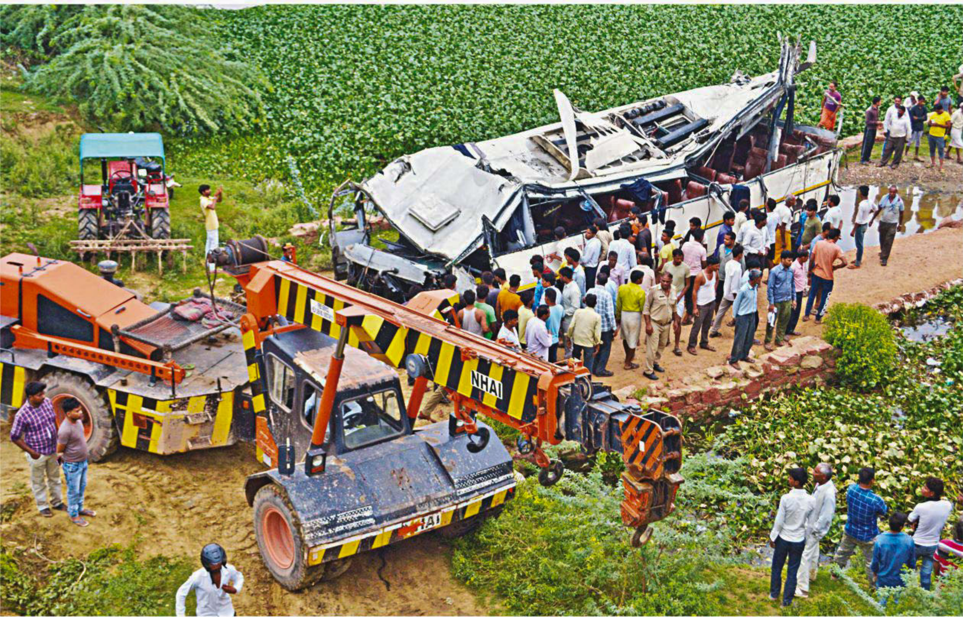
Onlookers and Indian police gather around the crumpled remains of a bus that crashed on the Delhi-Agra expressway, near Agra yesterday. At least 29 people were killed and 18 others injured when the bus careered off the expressway after the driver apparently fell asleep at the wheel.

Dozens of powerful Afghans yesterday resumed talks with the Taliban in Doha, where a possible ceasefire is on the table along with key issues such as women's rights. Stakes are high for the talks which follow a week of US-Taliban negotiations with both sides eyeing a resolution to the bloody 18-year conflict.