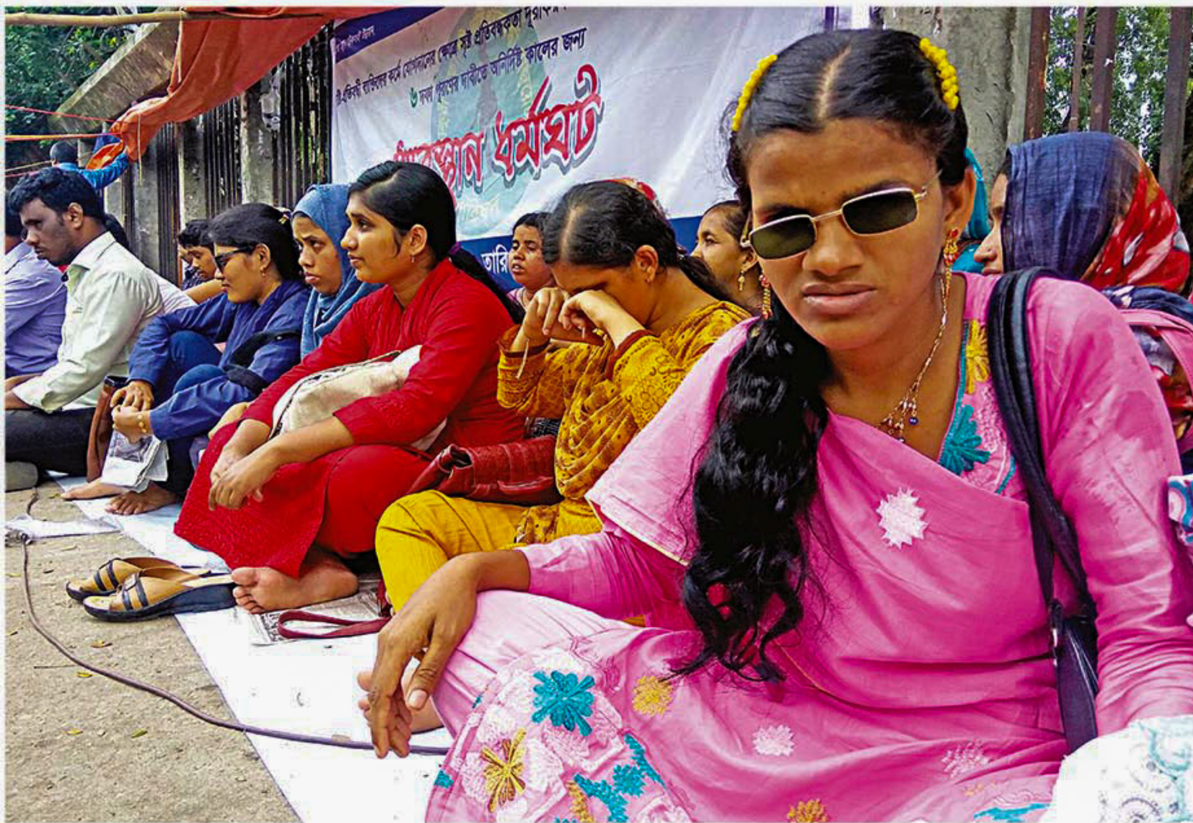
Visually impaired jobseekers under the banner of "Chakuri Prottyashi Drishti Protibondhi Graduates" formed a human chain in front of Jatiya Press Club yesterday, to press home their six-point demand including proper employment.