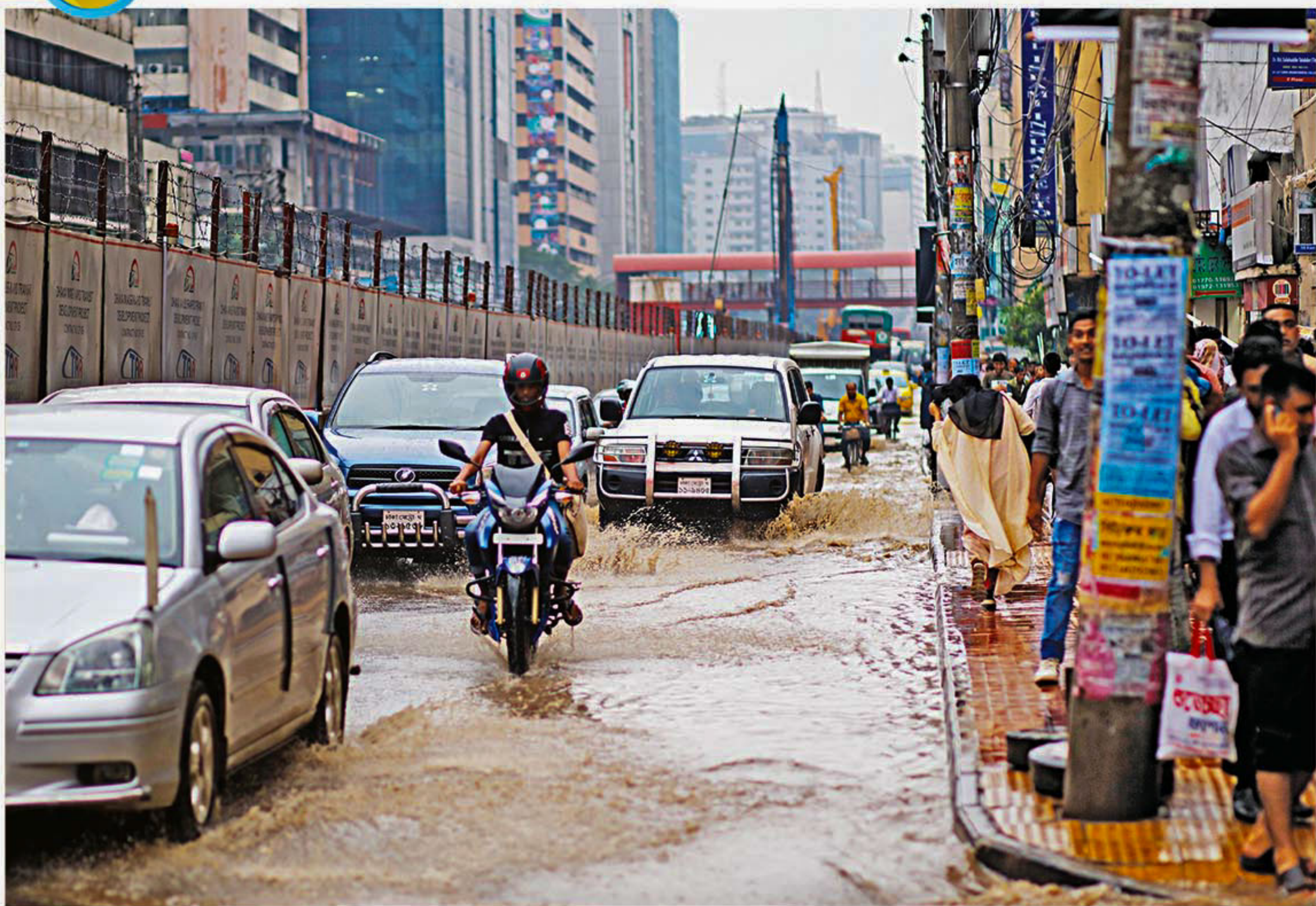
People huddle on the footpath and vehicles wade through mud and water after incessant rain in the capital yesterday. The photo was taken in Karwan Bazar.